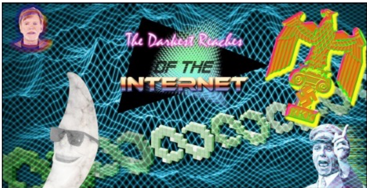
Image from Daily Stormer's A Normie's Guide to the Alt-Right (Anglin, August 31, 2016)

past future of "cyberpunk". Grafton Tanner (2016) offers an intriguing reading of the genre's ironic nostalgia for an imagined past future of the web as a meditation on the "uncanny" relationship between ourselves and our tools. What Tanner refers to as the "uncanny" and "haunted" vaporwave sensibility is built out of repeating fragments of the detritus of earlier digital culture. In Tanner's reading, vaporwave's endless haunted loops foreground the mechanical processes underway in the formation of contemporary subjectivity online. Grafton's argument is essentially that vaporwave brings one closer to the machine , opening human being onto the alterity of techne — a theme much discussed in contemporary media theory (see: Peters 2015). Here we can establish that, in spite of the apparent resemblance between vaporwave and fashwave as suggested by Ubermorgen, their philosophical outlooks are fundamentally antithetical. Whilst vaporwave exposes the machinic elements of human consciousness leading us away from the human form, fashwave seeks to construct a "new man" by awakening a "proto-fascist consciousness" (Theweleit 1987).