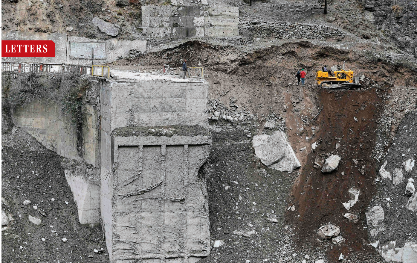
Workers clear debris in the Chamoli district of Uttarakhand, India, after a glaciated ridge failed on Ronti mountain on 7 February, causing massive flooding.