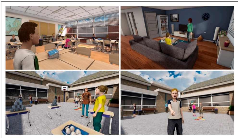
Figure 1. Virtual reality classroom, living room, and schoolyard environments.

Each session, therapists prepared children by explaining that they would use the virtual reality environment to try to evoke their angry feelings. Therapists could evoke children's anger by manipulating the virtual situation itself (e.g., letting the child lose a game and switching off the television) or by manipulating the speech and actions of the virtual characters. Therapists used a microphone with voice transformer to emulate a different voice for each virtual character. They used