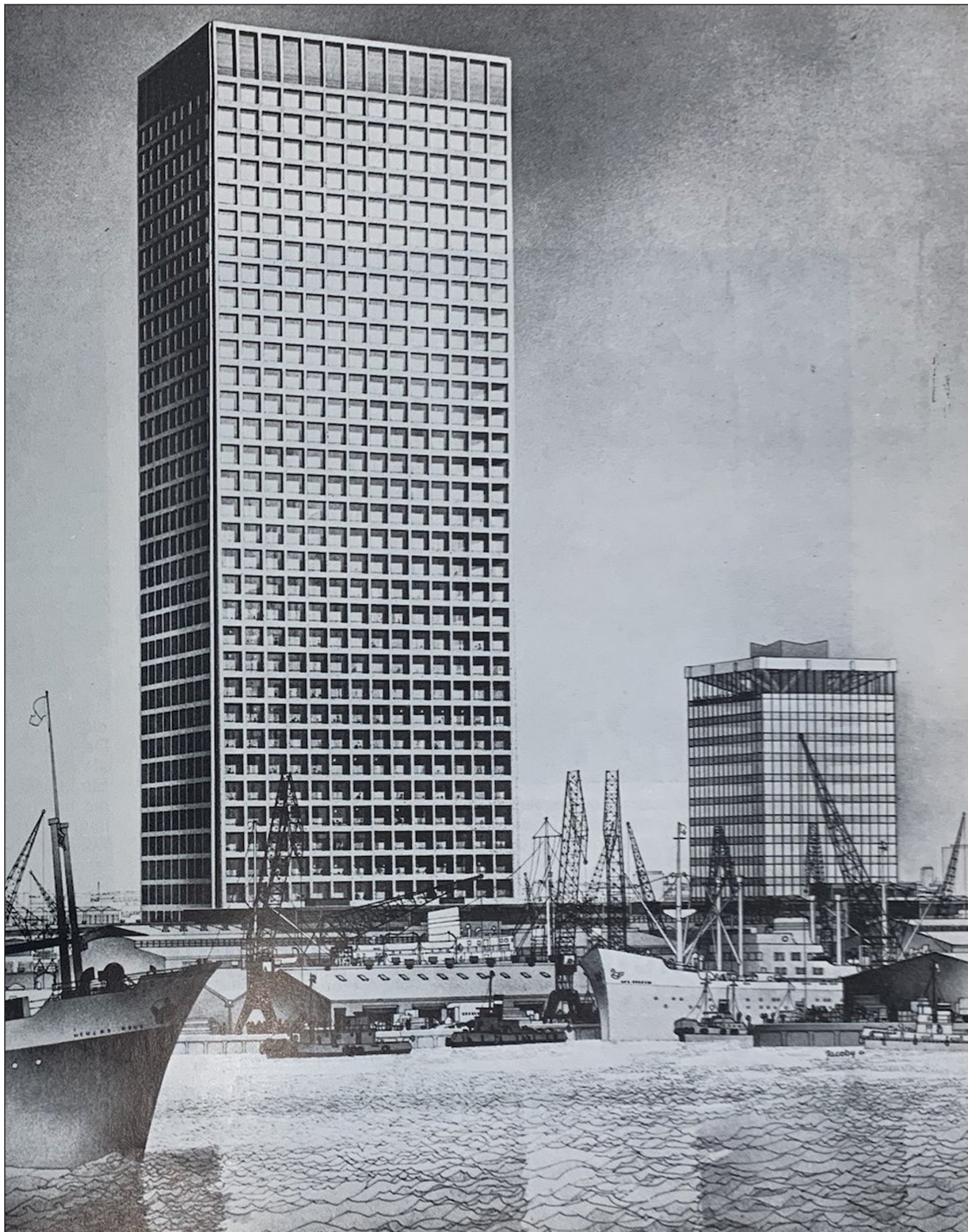
Figure 4: Drawing of the first Europoint tower sitting next to the Overbeek headquarters near Marconiplein (Engel 1969: 1869).

with the quality of Rotterdam's newly built environment, which they characterised as 'cheerless, impersonal, bare, cold, stiff, corporate and clumsy' (1968: 36). Such criticism was repeated ten years later, when the planning journal Wonen TA/BK invited the renowned architecture critics Stanislaus van Moos, Francesco Dal Co, and Kenneth Frampton to evaluate Rotterdam's reconstruction efforts. They were united in their criticism of the city centre—which in the words of Frampton was a collection of 'buildings looking for a city'—although more ambivalent about the Europoint development. Dal Co observed,