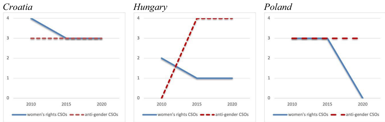
Figure 2. Changes in access to resources.