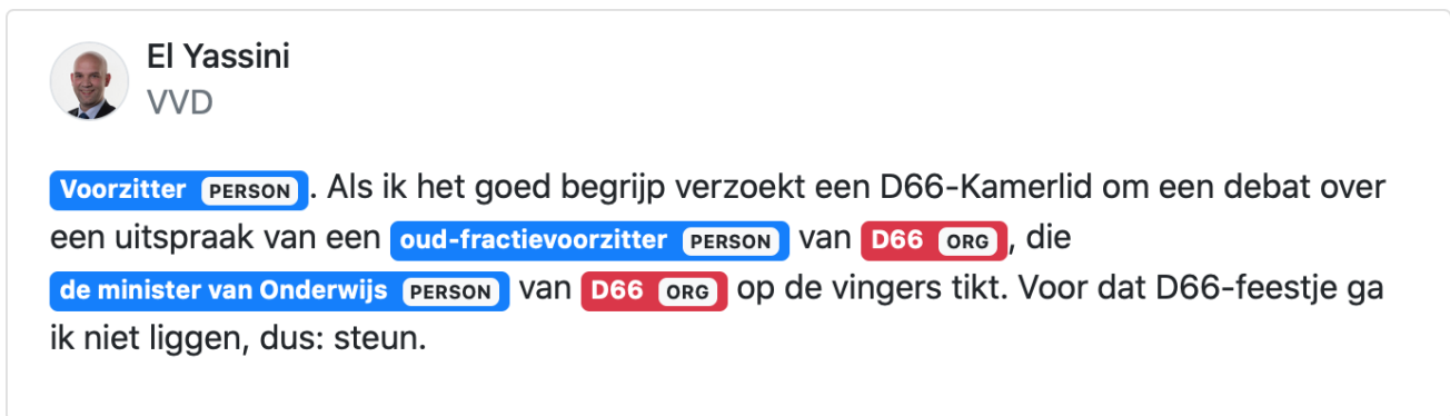
Figure 1: Result snippet with highlighting of political actors.