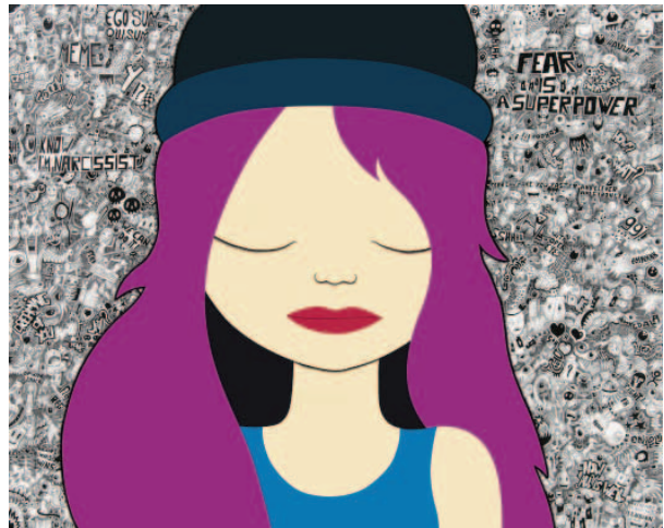
Fig. 1. Hackatao, Rez.Girl , tokenized on the SuperRare gallery. (© Hackatao)

The “dematerialization of art,” a phrase that was coined in 1967 by critics Lucy Lippard and John Chandler, identified the quintessential features of conceptual practices [3]. As Lippard later defined it, conceptual art was, essentially, “work in which the idea is paramount and the material form is secondary, lightweight, ephemeral, cheap, unpretentious and/or dematerialized” [4]. Conceptual art could be created