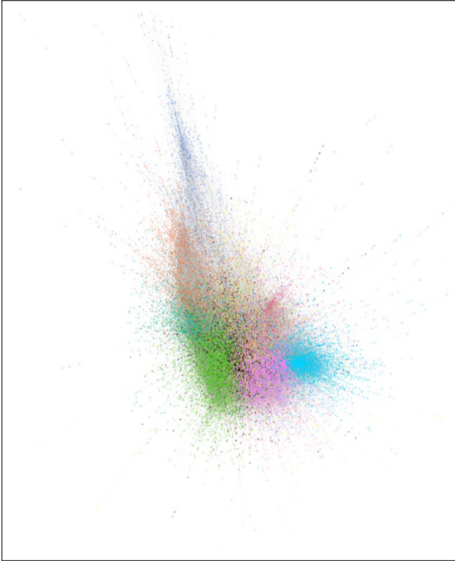
Figure 2. A graph representation of Instagram users in our dataset. Nodes are colored according to the clusters they belong to (see Table 1 for a description) and scaled according to their eigenvector centrality.

Instagrammers organize into clusters according to their lifestyles and backgrounds but neither on Instagram nor in the city are they far removed from others. People may have a primary reference group that is most consequential for how they understand and comport themselves, but this primary reference group is not apart from rest of the social world. While they associate with people with similar interests and lifestyles, they generally do not form enclaves. The entangled networks documented in this article are the structural backdrop of the cross-pressures that users experience as they consider posting to the platform. The aggregate result of these cross-pressures is that Instagram breeds conformity: the platform is used for a range of purposes by different groups but it nevertheless has aesthetic and social norms that all users have to reckon with (Manovich, 2016).