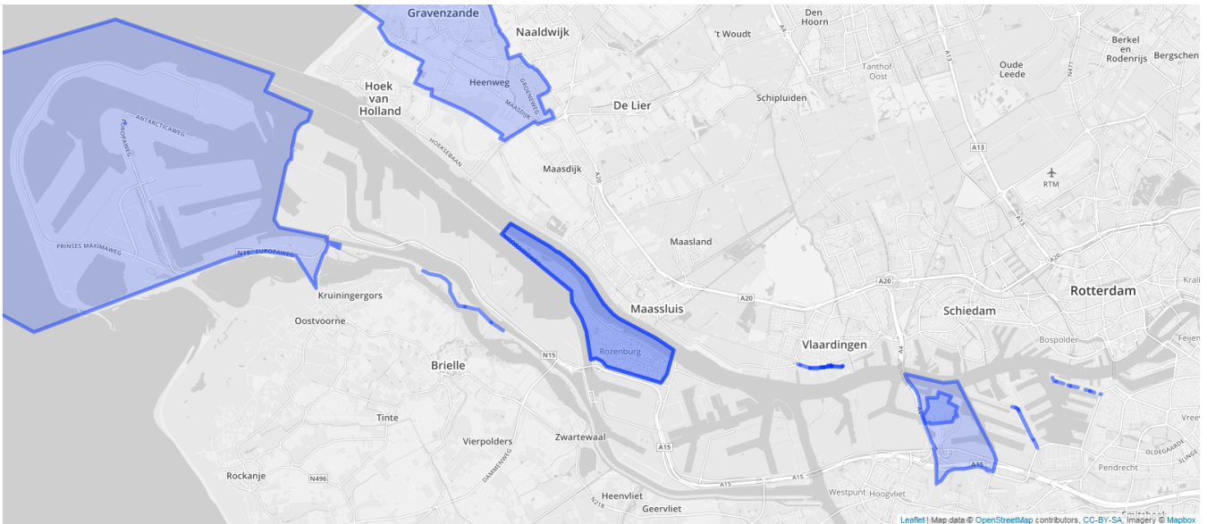
Figure 2: Slippy map with highlighted places that are mentioned in context of the Rotterdam harbor.