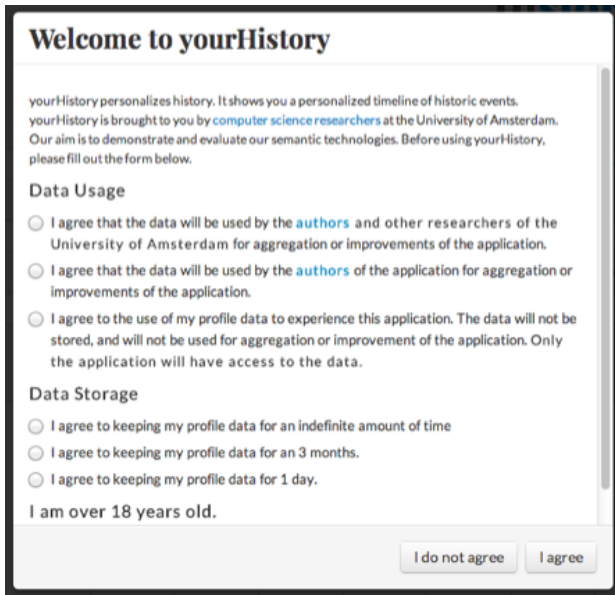
Figure 2: yourHistory’s welcome screen, and second stage of requesting user consent.

has complied), we offer the user a choice between allowing the aggregated profile to be stored for an indefinite amount of time, for 3 months at most, or for a single day. In any case, the data will never leave the University of Amsterdam. Finally, once the user declares she is over 18 years old, she is directed to yourHistory’s main interface.