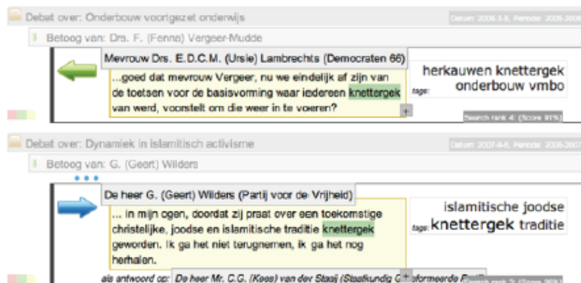
Figure 2: Who uses offensive language in the Dutch parliament?

which we can click and inspect. To follow this semantic link corresponds to implementing the semantic search approach outlined in Section 2. Identifying how often the term ‘ knettergek ’ is used per political party, person, or year is a clear use case for exploratory search in the form of (fuzzy) faceted search. Notice that this implicitly corresponds to the construction of a more complex search strategy under the hood. Once relevant speech portions are identified, we may request a list of people or political parties as result, which illustrates the importance of allowing arbitrary retrieval units as discussed in Section 2.