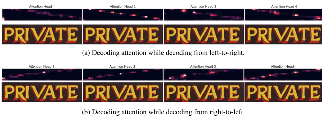
Figure 2: Visualization of the self-attention of layer 5 of the decoder while decoding the sequence from left-to-right. Each row in the matrix visualizes the attention distribution over the embeddings of the image on the X axis, while decoding the corresponding character in the input image.