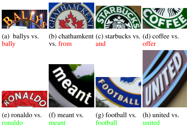
Figure 3: Examples of curved text examples from the CUTE80 dataset that are correctly and incorrectly predicted by Bi-STET. In black the ground truth is given.