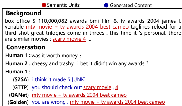
Figure 1: Background Based Conversation (BBC).