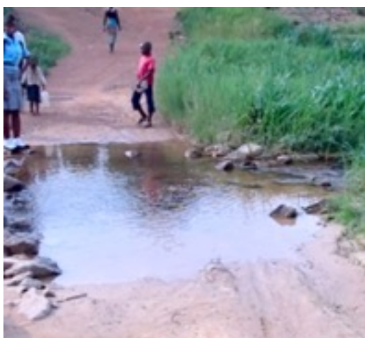
Figure 11 A schoolgirl crossing a stream

The teacher spotlighted its subject matter in a tone of disgust and indignation, directing the writer to look carefully at what it showed. “In fact you see here look at the school girl standing there...have you seen the girl? Have you seen her?” Locating the image in a wider narrative of pupils’ unsafe journeys to school, he explained that “in the rainy season when the pupils want to go to school unless they remove their shoes...they fold up their trousers...because no bridge has been constructed...they walk into the water...and go across it to...their various schools”. He also explained his failed attempts to consult the chief and local