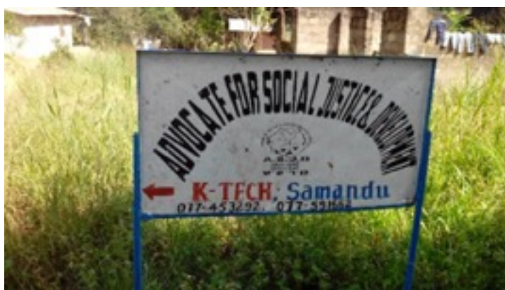
Figure 14 Advocate for Social Justice and Development NGO