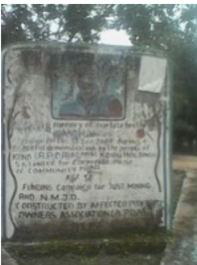
Figure 13 Image of a gravestone

The teacher explained that he had taken this picture to represent his sadness. "Just after I left the village, I saw this boy...look at this boy he is a small boy...he should be in school...he is without money...coming from a poor home except he do this to I don't feel good...just look at the face". The teacher recalled that the encounter process of taking the photograph had provided an opportunity for demonstrating his concern and finding out more about him; "I even stopped to ask him to know something of his problem". Recalling his encounter with the youth he explained that "he spoke to me that because of lack of money...he wanted to go to school but there is no way except he go into Okada riding...he preferred doing this to gain some little amount for himself". He also had found out that "one of the sad parts of the whole story...his mother died far back". The youth had as a result found himself responsible for caring for his family and contributing to the family income through Okada riding. Summarising his response, the teacher said, "it is really deplorable." He emphasised that "I really felt anger for the boy yesterday and the kind of situation he is living in." This prompted his analysis of the underlying national and educational challenge: "These are the people that needs help...he needs school; the mining company could help him...let's cater for children who are not going to school; let's help them; so that they can be educated and develop the country."