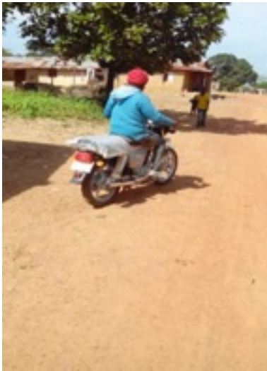
Figure 12 Image of a youth bike rider

from this school constructed it". These words evinced his pride in his own and his pupils' exercise of responsibility in response to their predicament.