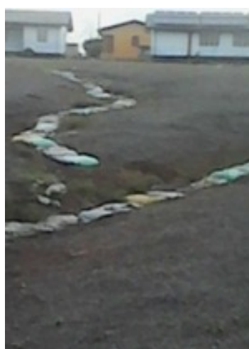
Figure 10 School grounds with soil erosion