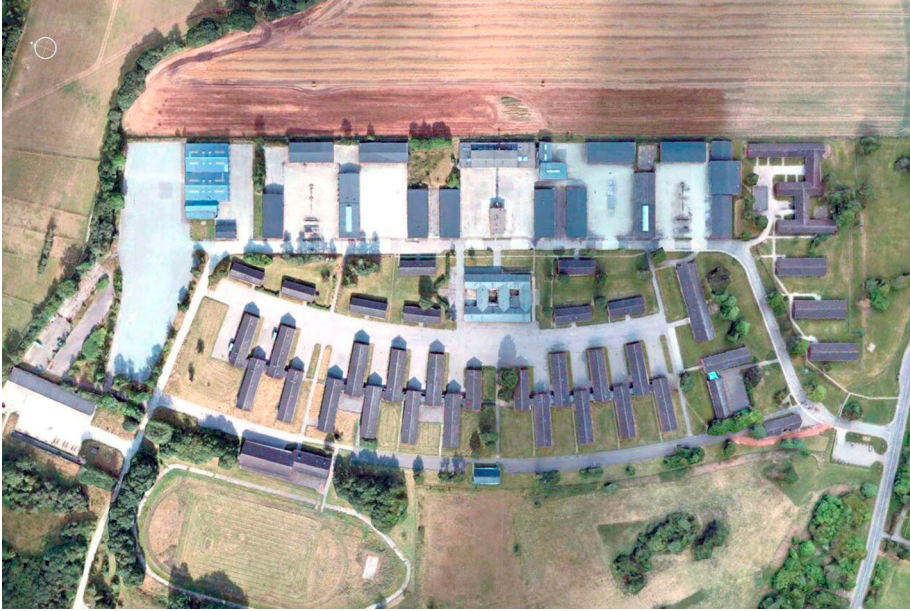
Figure 2 Satellite image of the Deportation Centre Sjælsmark. The facility has the capacity to house 6,000–7,000 rejected asylum-seekers but today only accommodates 400 people who have received a final rejection on their application for asylum

work or study (nor did they receive any daily allowance). Sjælsmark is run by the prison and probation service yet the Red Cross is subcontracted to offer limited activities, such as English lessons (residents are not allowed to learn Danish). Since 2017, the centre has also housed families with children although they are due to be moved to another centre run by the Red Cross as a result of public pressure. 38