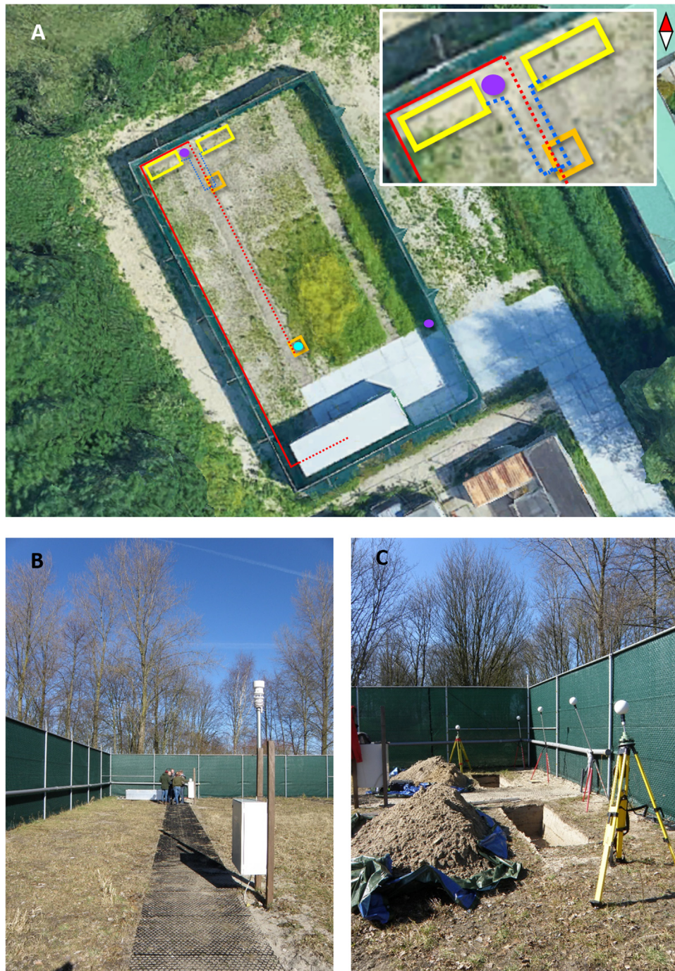
Fig. 2. A: Detail of the map in Fig. 1, including a magnification (inlay), showing the facility and the location of the data logging hubs (orange squares), the ground water wells (purple dots), the weather station (light blue dot), the first two pits (yellow rectangles), the wires from the pits to the hubs (dark blue dotted lines) and from the hubs to the hardware in the shed (red lines). The shed is in the south west corner. B, C: Pictures of ARISTA during the first inhumation, in the northwest corner of the field. The data logging hub in the foreground carries a weather station. The pipeline along the north and west walls carries the wiring from the hubs to the hardware in the shed.

The AMC is situated in the southeastern part of Amsterdam and built on land which was reclaimed from peaty wetlands, moors and lakes. From the early 1600s onward, this part of the province of North-Holland, near the border with Utrecht (Amstelland), was drained with mills. It was then filled, mainly with sandy and peaty