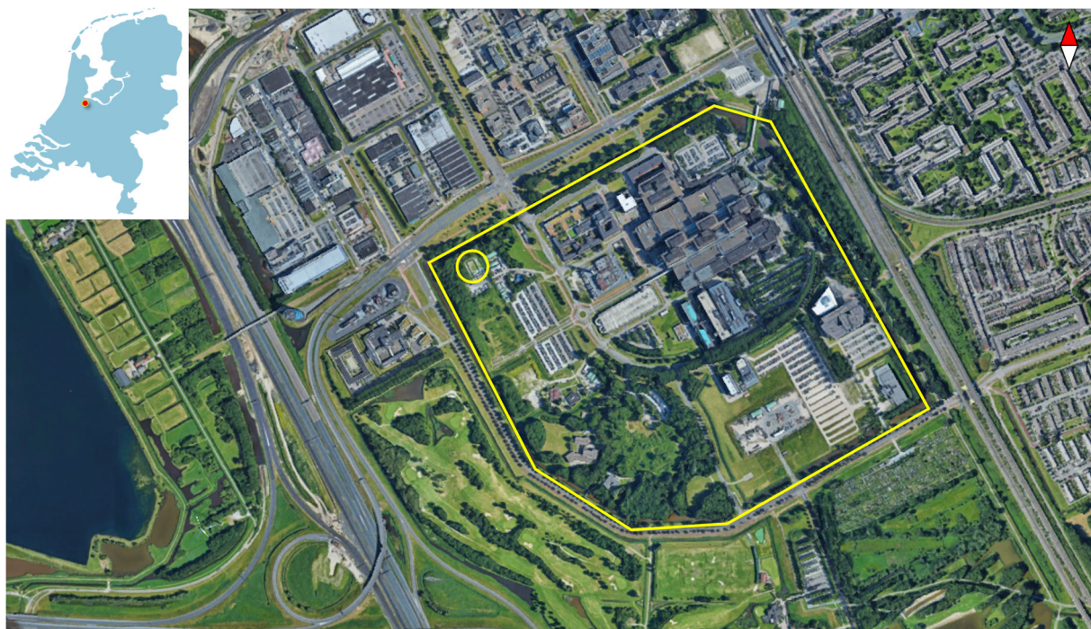
Fig. 1. Map (Google Earth) of the south east of Amsterdam with the location of the plot assigned to the HTRF (yellow circle) on the AMC territory (yellow polygon).

From 2011 onward, efforts were made to find a suitable location for the HTRF, preferably in the direct vicinity of the responsible institute (AMC). This preference served to ensure ease of access to the BDP's morgue, technical assistance and facilities. To this end, a proposal was drafted and presented to the AMC's board of directors, who subsequently expressed support for the project. As a result, around 500 square meters of unused land in the periphery of the hospital's private terrain were allocated for this project (Fig. 1) in collaboration with the local housing department. This land was then included in the assignment and zoning plan of the AMC, which was due for re-evaluation by the Amsterdam city council in 2014, who approved it a year later. As the area surrounding the AMC is densely populated, the board of directors precluded on-surface decomposition studies and agreed exclusively to subterranean decomposition studies to prevent nuisance to nearby residents and offices.