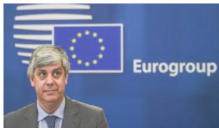
Who pays for the war on Covid-19? April 15, 2020 In "Covid-19"