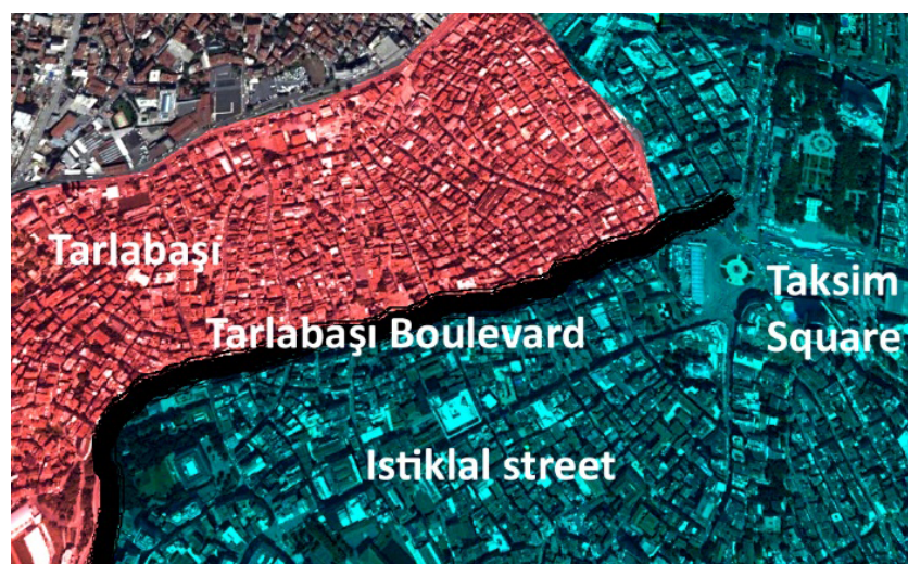
Figure 1. Tarlabası Boulevard separates the Tarlabası neighborhood from Taksim square and the İstiklal street area.

During the last decades, Tarlabası Boulevard has become a place for street sex work linked to precarious and vulnerable conditions as sex workers are exposed to greater violence from clients and police controls and the threat of sexual exploitation networks. Concomitantly, newcomer refugees from the war zones of the Middle East and North Africa arrived in Tarlabası in mid-2000 and especially during the current refugee crisis. The vast majority of Tarlabası residents are working in informal and precarious jobs as sex workers, waste collectors-rag pickers, peddlers, and street vendors, selling food in the nearby tourist areas for very low pay (Can, 2020; Türkün & Şen, 2009). Other employments linked to the region’s residents include temporary labor in the textile