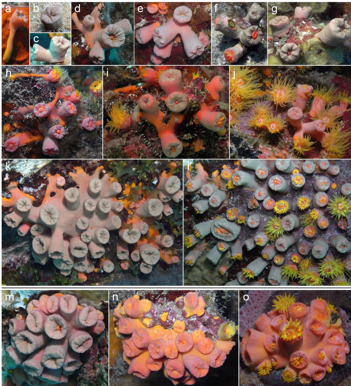
Fig. 1. Cladopsammia manuelensis (a–l) and invasive Tubastraea coccinea (m–o) at various localities (with depths) at Curaçao, southern Caribbean (2014–2017). (a) Snake Bay, 16 m. (b, c) Marie Pampoen, 17 m. (d, j) Hilton, Piscadera Bay, 12 m. (e) Caracas Bay, 9 m. (f, g) Water Factory, 16 m. (h, i) Caracas Bay, 20 m. (k, m) Carmabi, Piscadera Bay, 3 m. (l) Tugboat, Caracas Bay, 4 m. (n) Superior Producer shipwreck, 30 m. (o) Hilton, Piscadera Bay, 1 m (on a concrete pillar).

based on the presence of a basal plate, which is visible in some of the larger specimens (Fig. 1; Appendix S1) but is absent in R. goesi (Cairns 2000). Previously, the basal plate was not noticed