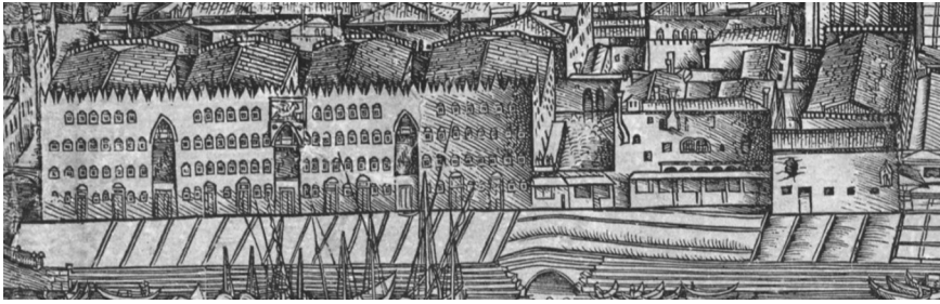
FIGURE 6.3 Detail of Jacopo de' Barbari, "Bird's-eye view of Venice", 1500.

This detail shows the waterfront of the western side of the Piazzetta, with on the left the large, multi-story public granaries, built in the fourteenth century and razed at the end of the eighteenth century.