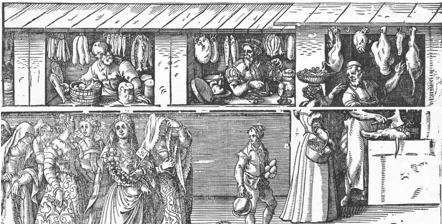
FIGURE 6.2 Detail of Jost Amman, “Festa della Sensa”, (Frankfurt am Main, 1697).

The urban renewal project that started in the 1530s sought to limit the presence of the market and shops in the San Marco area, thus reducing the function of the area as a marketplace and emphasizing it as a governmental space. 47 Sansovino’s stylistic