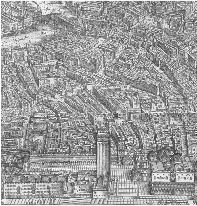
FIGURE 6.1 Detail of Jacopo de' Barbari, “Bird’s-eye view of Venice”, 1500. This detail of De Barbari’s famous map shows Rialto, Piazza San Marco, and the Piazzetta. Minneapolis Institute of Art, The John R. Van Derlip Fund (2010.88).