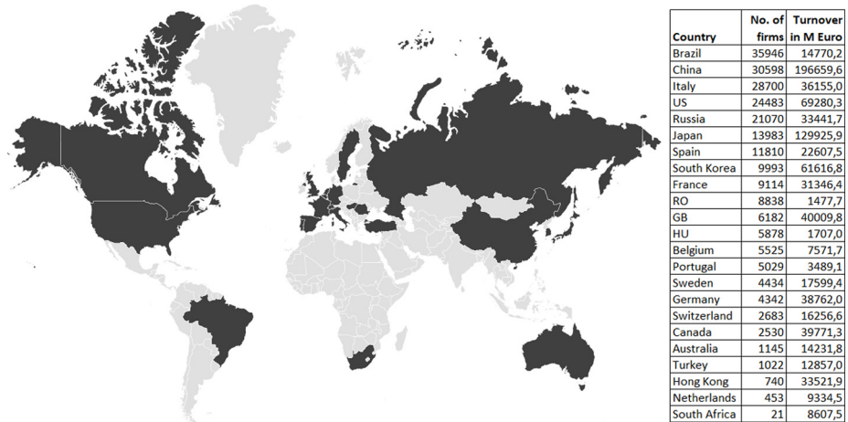
Figure 3. Indicative overview of importers' presence worldwide

The Orbis data shed light on patterns, despite the limitations, and seem to reveal different roles that came to the fore in our industry contacts as well. For example, China and South Korea may “score” high given the proximity to production locations, with many firms offering specialized services to e.g. western importers that need “local” agents, buying houses or traders. Hong Kong likewise is a relatively easy point of access for several