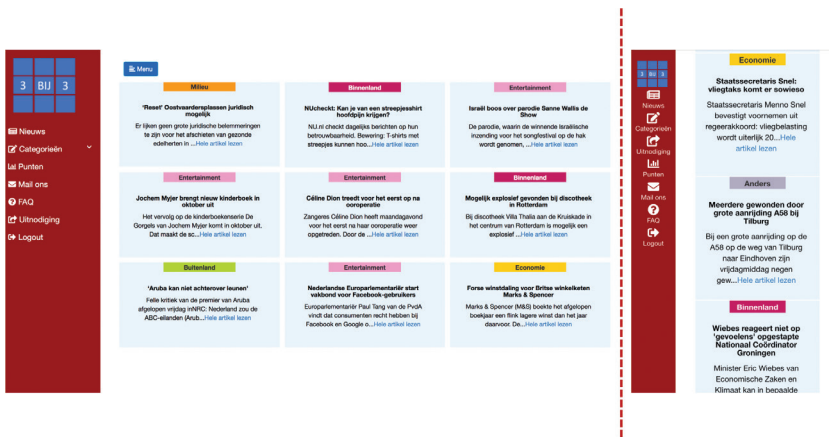
Figure 2. User interface main page (left: desktop, right: mobile) showing the navigation menu on the left side and the selection of stories (with colored topic tag, headline, and short teaser) on the right side.

While the user is interacting with the application, their behaviour is recorded at several steps along the way. After a registration including ethical consent, the user can login on the website using a username and password. Each log in is saved to a MySQL database, including information about the device being used to access the website. This allows for selecting the appropriate design for screen size by having a responsive layout including the highest flexibility for the users. After this, the user is led to the main page of the application, showing nine articles either in a 3x3 format or below each other (Figure 2).