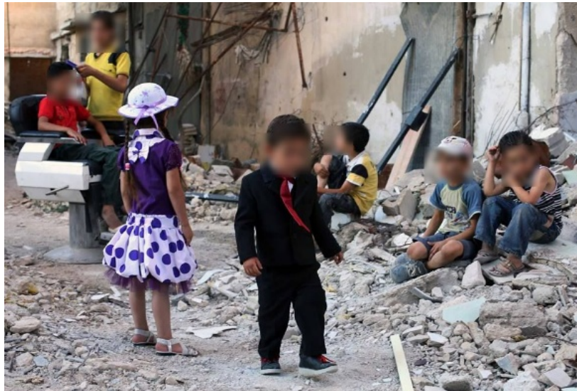
Figure 3. In posts in which love and sad go together, the dominant visual story is about children (love) amid rubble (sad).