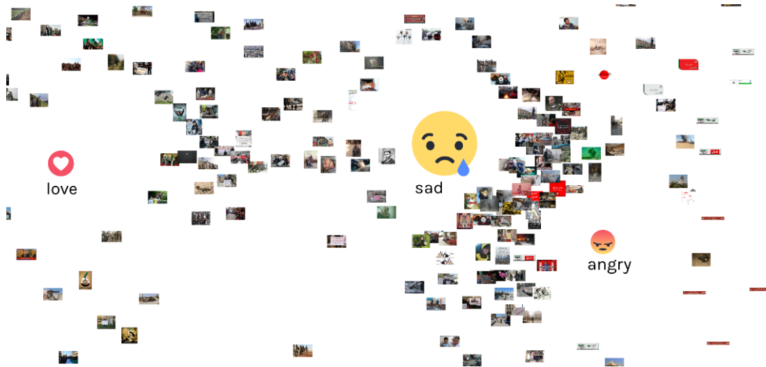
Figure A2. A cropped depiction of the visualization in which images of posts with both sad and angry are more visible. Children were dominant protagonists in this zone whereas we saw more antiregime soldiers and sign-holding activists around the love button, see next crop.