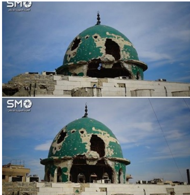
Figure 2. Religious symbols are more apparent when we reverse sad and angry (sad first in correlating posts).

Helplessness and frustration, being subordinate emotions that fall under the basic emotions of anger and sadness (Laros & Steenkamp, 2015), are particularly vivid when looking closely to a post with a 100% ratio of sad and anger: the image of a young man taking a selfie with bombardment fire in the background. In the images of the love and sad combinations ( N = 22 ), no clear differences were found between images where sad comes in first ( n = 12 ) or love as first ( n = 9 ). The most common visual characteristics in these posts were: male rebels ( n = 7 ) and children ( n = 8 ). Remarkably, 7 out the 8 images depicting children, show them in the context of festive events, such as Eid al-Fitr. When accounting for the texts that go with these images, all set out how children are the symbols of hope and life for this page public.