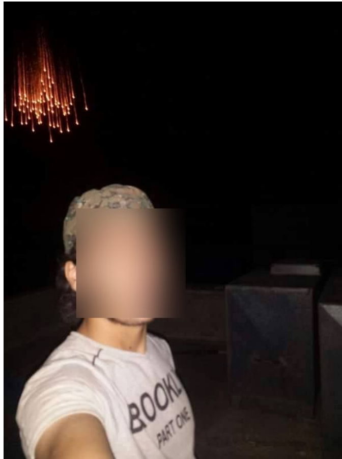
Figure 1. Combining the common visual symbols associated with angry (fire, rubble, bombardments) and sad (people).

Sad-first images ( N = 23 ) with angry following second, show similar content as the angry-first images (fire and rubble in 13 images). However, when accounting for translations of the accompanying texts, the rubble images with sad as a first reaction, are of bombarded mosques (see Figure 2) that might account for the fact that sad slightly wins in these cases. The destroyed religious houses seem to evoke more feelings of loss, and anger gets pushed to the background. From the fact that images of bombardment, fire, and other consequences are associated with significant collective combining between sad and angry, we derive that posts depicting a destroyed mosque, a symbol of Islam, serve as stimuli that appeal to subordinate emotions in users. Namely frustration and indignation seem to be weighed against each other when choosing to hit angry or sad. Fire and rubble being more inanimate, collect slightly more anger and images with more humane or religious symbols ignite more indignation.