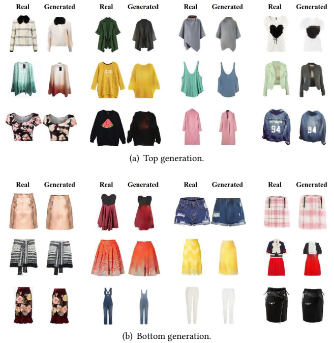
Figure 3: Comparison between real and generated images.

We list some recommendation produced by FARM in Figure 4. For each input, we list the top-10 recommended items. We highlight