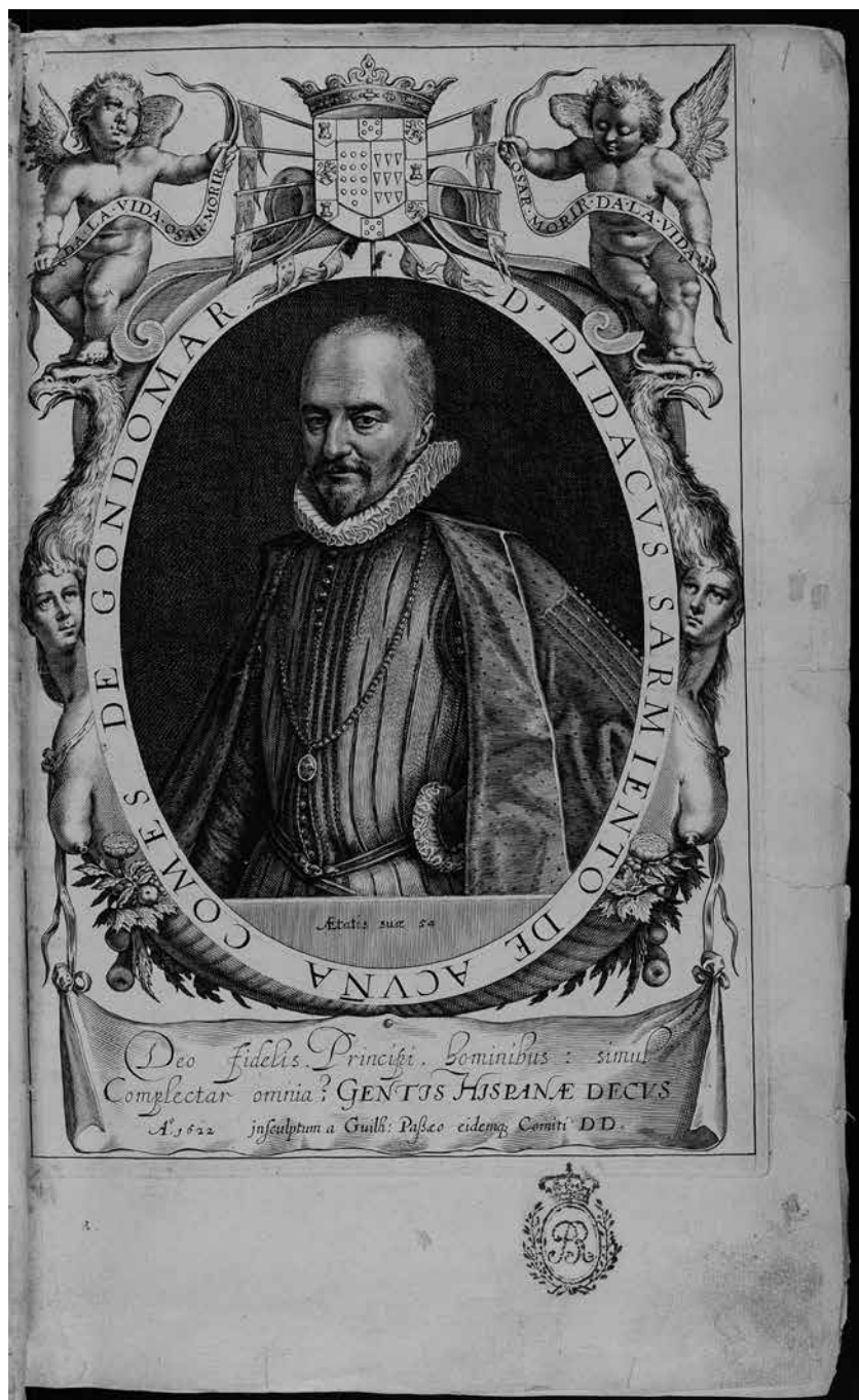
Figure 3.1 Portrait of the first count of Gondomar by Willem de Passe (1622)