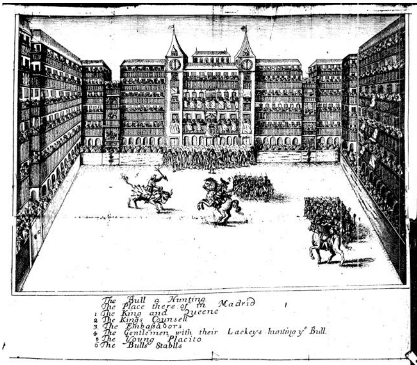
Figure 6.1 An Impartial and Brief Description of the Plaza (London: Printed by Francis Clarke for the Author, 1683), p. 8