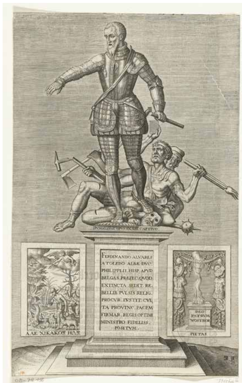
Figure 2.2 Seventeenth-century engraving of the statue of the Duke of Alba