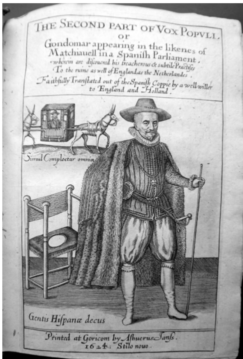
Figure 3.2 Front page of Thomas Scott, The Second Part of Vox Populi, or Gondomar Appearing in the Likenes of Matchiauell (1624)