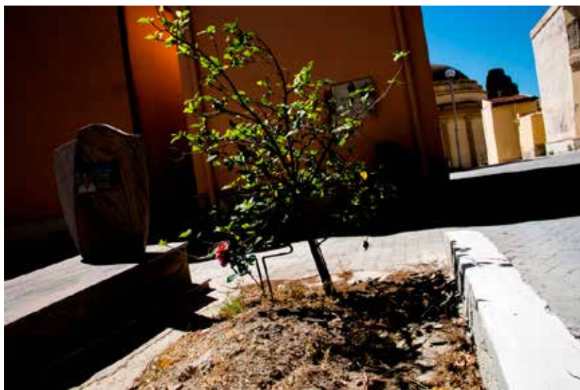
Figure 5.1 Roses planted by the cemetery caretaker on an unknown migrant woman’s grave. Porto Empedocle, Sicily

Database , 5 her body was found at the location 34.359 N 12.3568 E, 53 nautical miles off Lampedusa on 18 June 2007, and it was forensically examined and subsequently buried on 19 June 2007. From the forensic investigation, the level of decomposition indicated that she died approximately fifteen days before she was found. Authorities established that she drowned, that her height was 1.65 meters, and that she was of African ethnicity. Horrified by how the woman had died – her body decomposed and unidentified, missing any official recognition of death (such as a death certificate) – the cemetery caretaker kept telling Giorgia ‘she’s alone’ and had planted roses on the grave (see Figure 5.1). Although she was a stranger, he cared for her body and grave.