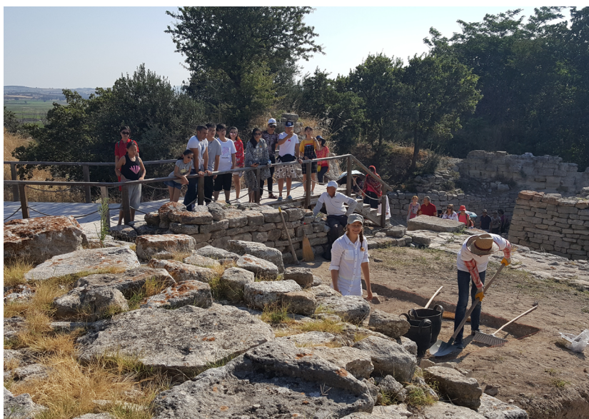
Figure 1 Archaeological site of ancient Troy open to the public while students are excavating (August 2018,).