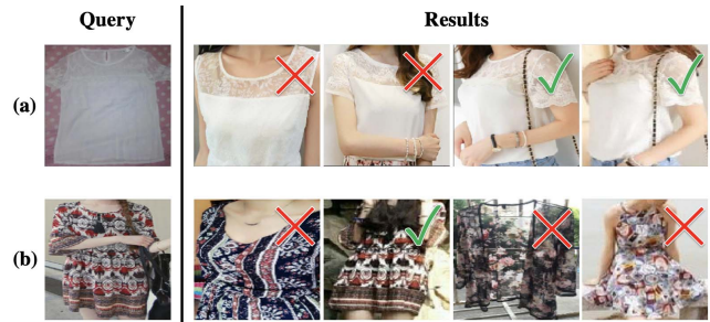
Figure 1. (a) Consumer-to-shop task . A gallery with shop images is queried with a consumer image. The most left image represents the query consumer image, the four images on the right are the first retrieved results with an indication whether the instance is correct or wrong. The differences between the retrieved results are often subtle. (b) Shop-to-consumer task . A gallery with consumer images is queried with a shop image.

Recently a new dataset has been released to encourage research on cross-domain fashion instance retrieval, namely DeepFashion2 [3], which is an extension of DeepFashion [12]. Compared to DeepFashion, DeepFashion2 has a larger focus on cross-domain retrieval, since it contains more pairs of consumer (user) and shop (commercial) images. The dataset that is currently available for download consists of