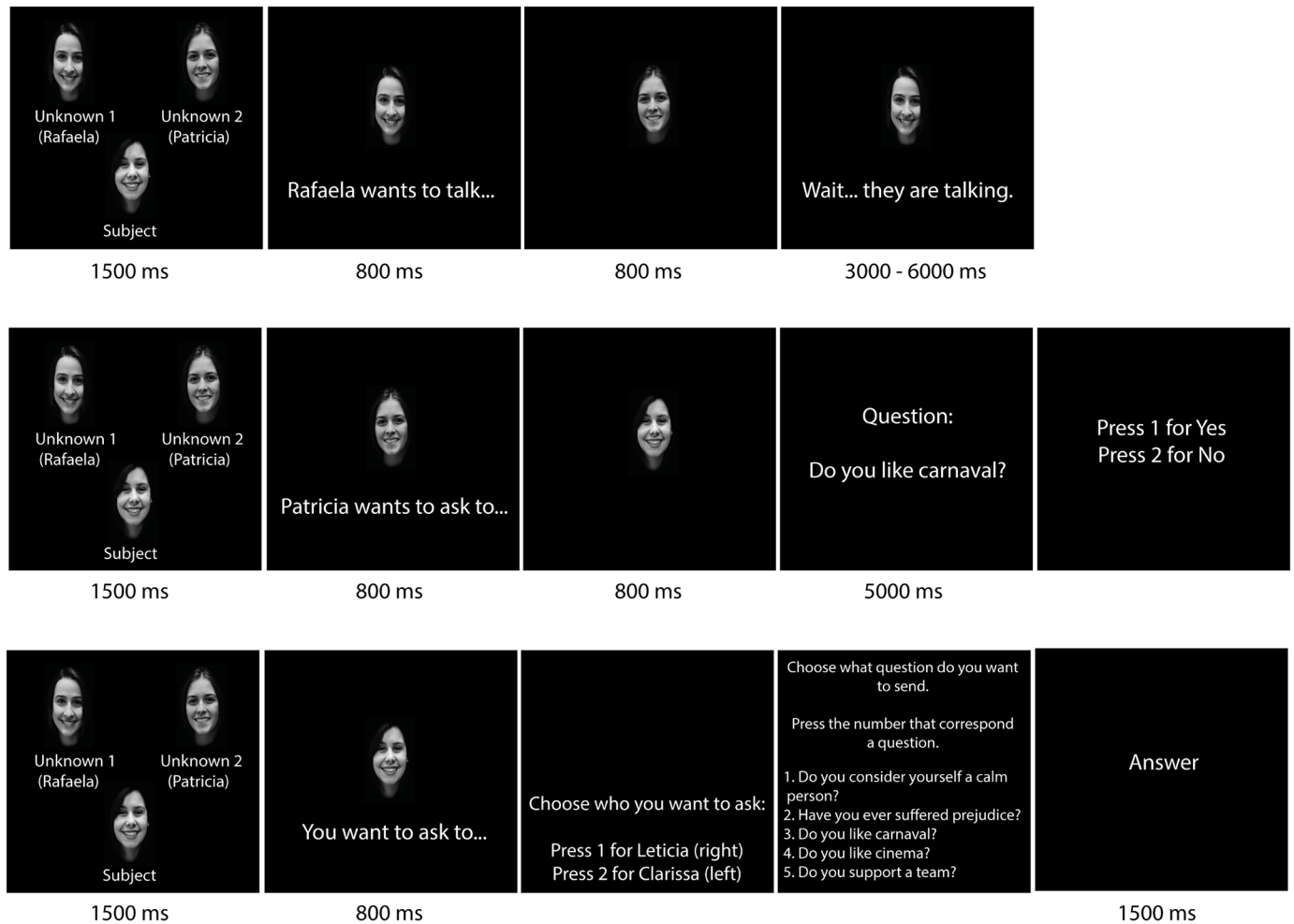
Fig 1. Experimental design of chat room. a) Confederate participants talking between themselves; b) Participant receiving questions from one of the fictitious participants c) The participant chooses one of the fictitious participants to direct a question of their choice. The individuals in this manuscript has given written informed consent (as outlined in PLOS consent form) to publish these case details.

https://doi.org/10.1371/journal.pone.0184215.g001