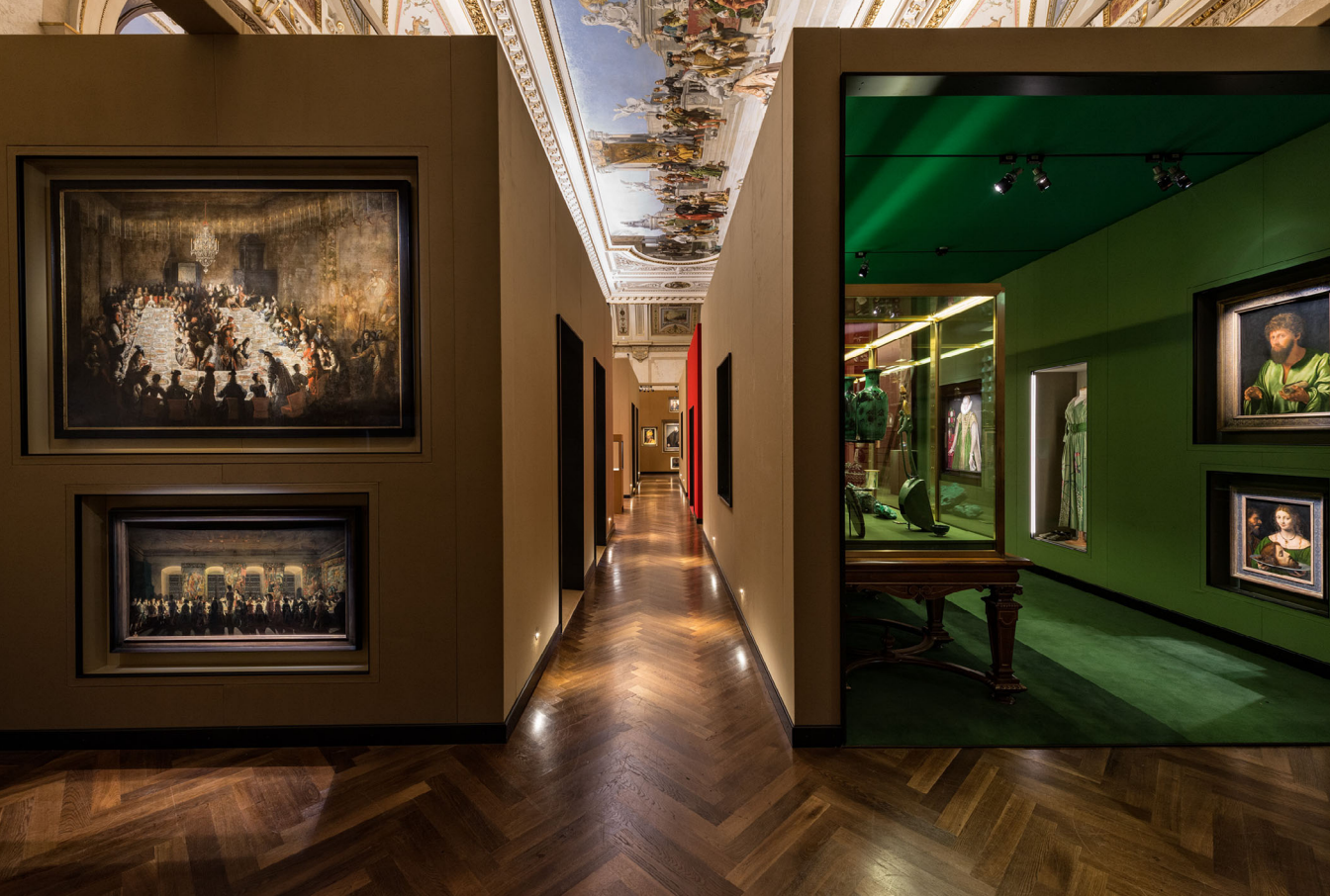
Figure 1. Exhibition View: Overview. [Color figure can be viewed at wileyonlinelibrary.com ]

objects, namely: green objects, portraits of children dressed as adults, miniatures, animals, wooden objects, and lastly, boxes and cases. For example, the green room is designed around a spectacular emerald vessel, which is surrounded by an eclectic mix of objects in a similar color palette, ranging from taxidermy birds and ethnographic musical instruments to antique statuettes and modern theatre costumes. The wooden room not only contains all manner of wooden objects encased behind glass panes but is paneled entirely in wood. As such, it carries the smell of wood, strengthening the theme of the room and its sensory effect. The room of animals, or the ‘zoo,’ contains the title object of the exhibition. Taken from a packed, rarely-viewed vitrine in one of the KHM’s Ancient Egypt galleries, the small wooden coffin, which used to contain a mummified shrew