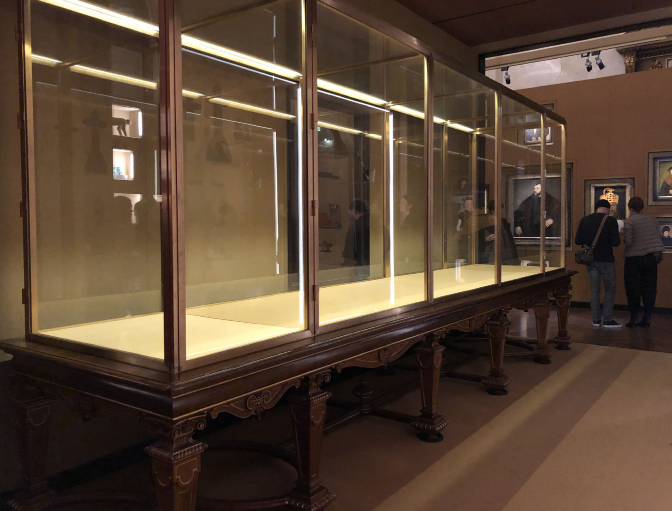
Figure 4. Exhibition View: Vitrine from the Original Furnishings of the Collection "Kunst industrieller Gegenstände" (today Kunstkammer) . [Color figure can be viewed at wileyonlinelibrary.com ]

encouraging visitors to engage with the objects aesthetically rather than contextually or narratively. The visual impact of the exhibition extends outwards from the gallery itself: Malouf's object illustrations can be found throughout the KHM in the places from where those objects have been temporarily removed. For those looking for a verbal element, the non-complimentary, optional audio tour provides a deeper insight into the decisions behind some of the object selections and ordering principles, as well as the curatorial processes of Anderson, Malouf, and Sharp.