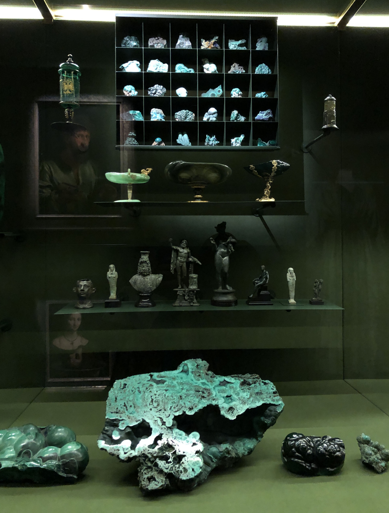
Figure 5. Exhibition View: Green Room detail, objects 17-67. [Color figure can be viewed at wileyonlinelibrary.com ]