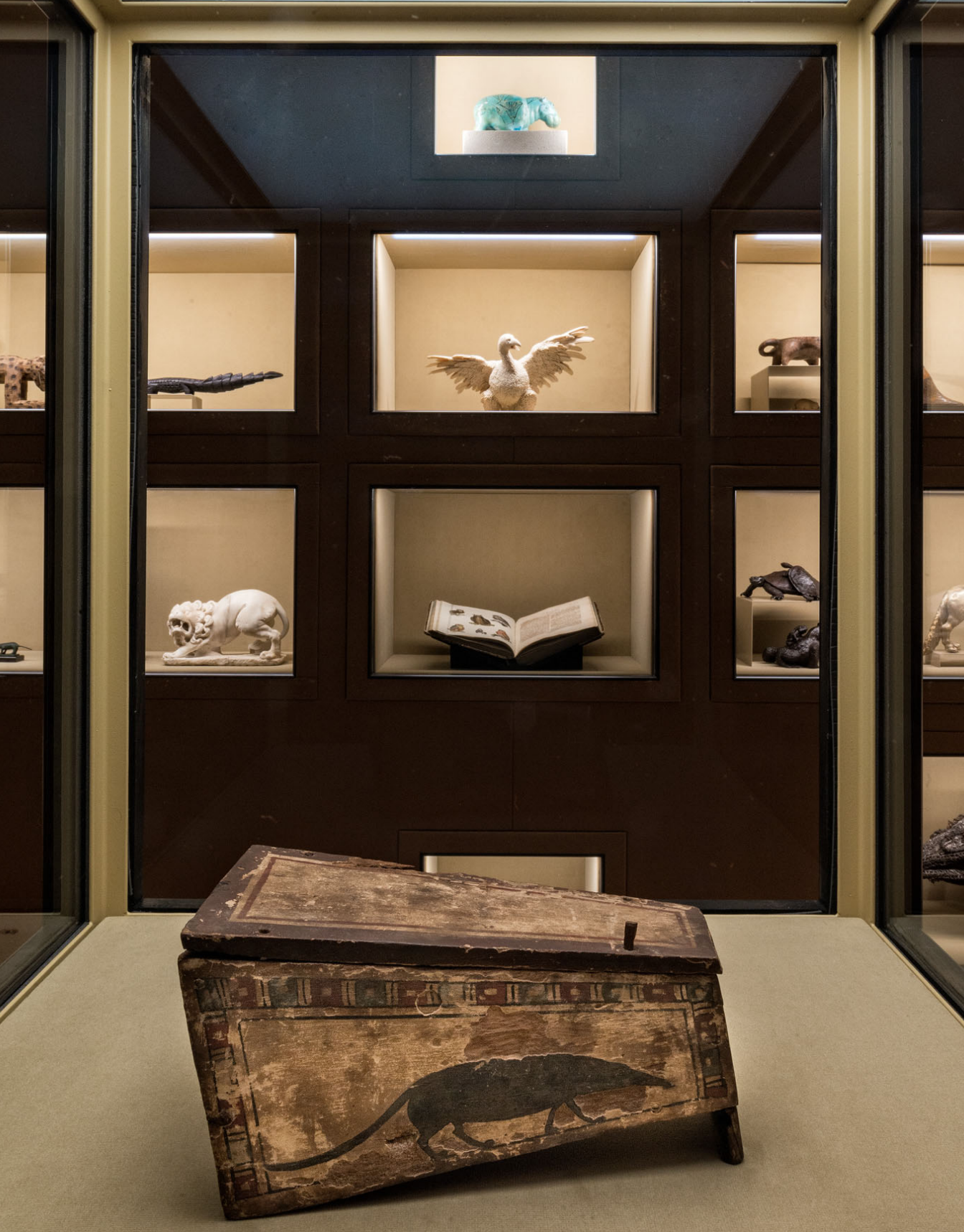
Figure 3. Exhibition View: Coffin of a Spitzmaus (Shrew) . [Color figure can be viewed at wileyonlinelibrary.com ]