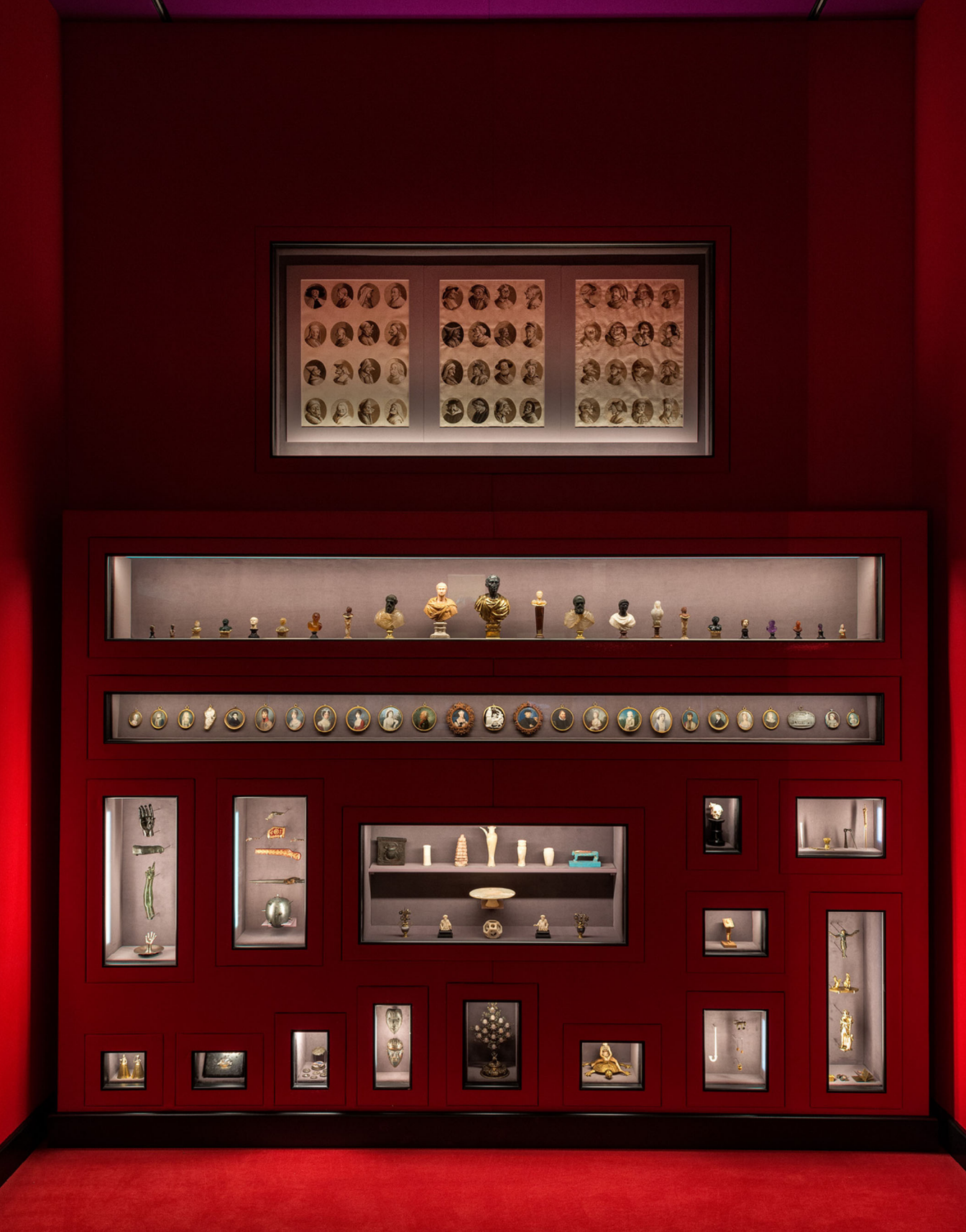
Figure 2. Exhibition View: Miniatures Room. [Color figure can be viewed at wileyonlinelibrary.com ]