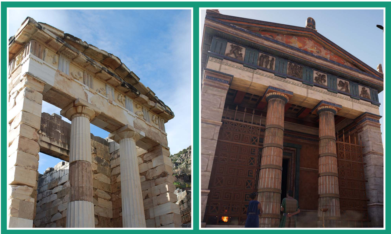
FIGURE 4. The front of the Athenian Treasury at Delphi and the same location in Assassin's Creed: Odyssey.