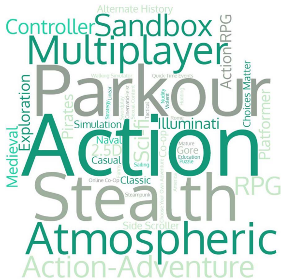
FIGURE 2. A word cloud showing the most used tags (short words describing an aspect of the game) that the player community has used to refer to Assassin's Creed games on the popular game platform Steam. Frequency data of these tags were collected using SteamSpy's public API (SteamSpy 2019) in March 2019.

represented. Players can consult the in-game encyclopedia, a "database" written in the voice of a game character, to learn more about Karl Marx ( Assassin's Creed: Syndicate ) or the Basilica of San Lorenzo ( Assassin's Creed II ), for example. At the basis of these games is a clear love for the past in and of itself, which is also reflected in Ubisoft's employment of a full-time historian and frequent consultations with experts (Copplestone 2017). Because of this attention to detail, Assassin's Creed can perhaps be experienced as a form of virtual heritage tourism (Champion 2011, 2015).