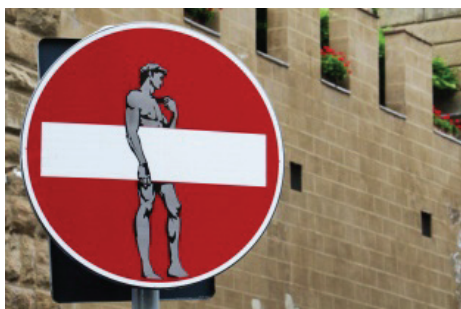
Figure 11c: Florence, Italy.