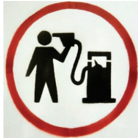
Figure 6: Using gasoline is committing suicide. 12