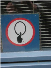
Figure 5: Be silent. 11

I submit that the café table with a male, red devil and a female, black angel in Figure 7, too, has the wrong form. Since these icons, when used together, are conventionally used to signal bad temptations and good advice, respectively, the meaning could be something like, "in this café you are exposed both to the bad and the good" (pleasant versus excessive drinking? interesting contacts versus people who want to seduce or deceive you?). There is some freedom of interpretation here, but this freedom is constrained by (1) the fact that this is a prohibition sign; and (2) its location in a café. But surely this café table is not meant to issue a "thou shalt not ..." message. Rather, it suggests something along the lines that here (i.e., in this café) there are both bad and good things that may attract your attention. A warning sign would have been more suitable (but a triangular café table is probably inconvenient ...).