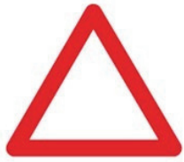
Figure 1a: "You are warned that..."

both in terms of colour and in terms of form . In many cases, the traffic signs feature an iconic silhouette, or language, or both, to make clear what the traffic user is warned or informed about, or forbidden/permitted to do.