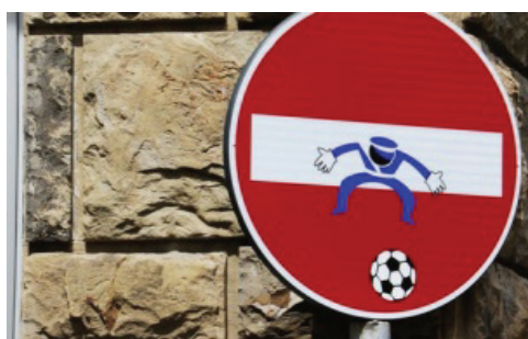
Figure 11c: Florence, Italy.

These signs are clever and funny – but they do not manifest any persuasive power, nor are they ostensibly intended to do so. Their creativity is purely formal – although it is in principle always possible that when used in different circumstances (i.e., by changing the prag-