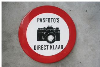
Figure 9: “Traffic” sign in front of a photo shop (Haarlem, The Netherlands) offering a passport photographing service. 15