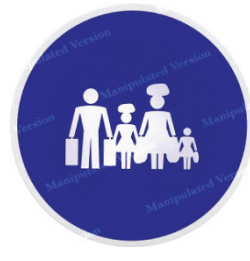
Figure 2: Standard traffic sign “this is a footpath”.