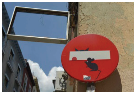
Figure 11b: Traffic sign in Budapest, April 2018. 17