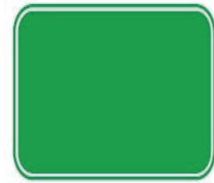
Figure 1d: "You are informed that..."

Because of the highly coded "speech act" the traffic sign templates present, it is possible to deploy them for humorous purposes, or even to persuade viewers to adopt ideas, or undertake actions, that are not related to behaviour in traffic. In Forceville and Kjeldsen ( op. cit. ) we discussed some examples of both. An example of a "traffic sign" in which a rhetorical point is made is Figure 3. We are all familiar with Figure 2, an "instructive" sign indicating a footpath. Figure 3, by varying on Figure 2, makes the point that it is odd that the adult and child on the official sign by default seem to be male, exposing this gender bias by depicting the two humans as female. Even though this traffic sign probably was an embellished actual sign in the real world (rather than a photoshopped version of a picture of such a sign), from a rhetorical perspective its precise location does not matter much anymore: unlike in Figure 2a, one can relocate the sign to make a more general point: "it is wrong to (standardly) use the male variety of the species as the default to depict 'people'."