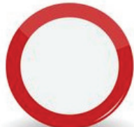
Figure 1b: "You are forbidden to..."