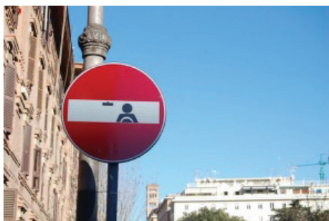
Figure 11a: Street art by Clet Abraham. 16

manipulated traffic signs such as the "forbidden entry from this side" signs in Figures 11a–d.