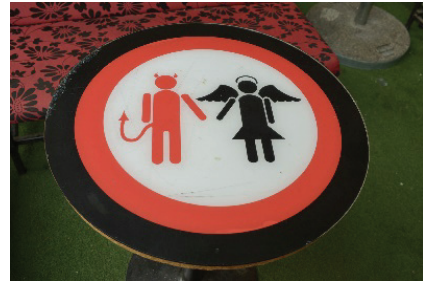
Figure 7: Devilish temptation and angelical good advice. Café table Budapest, April 2018. 13