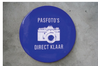
Figure 10: Manipulated version of the “traffic” sign in Figure 9. (Thanks to Pieter Manders for creating this version.)

Even though their “grammar” may be faulty, all of the above examples intend to make rhetorical points. This is not the case with