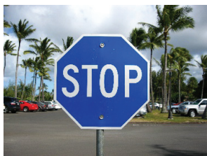
Figure 8: Traffic sign on private property in Hawaii. 14

The “traffic sign” in Figure 9 is a forbidding sign which, by virtue of the iconically depicted photo camera, presumably has something to do with photographing. Without the text one could easily envisage coming across it on a spot where one is not allowed to make photographs – but as a matter of fact the sign is placed in front of a photo shop, and therefore would be expected to invite or instruct people in a positive way about photographs, as the accompanying (Dutch) text indeed corroborates: “passport photographs – immediately ready”. In this case, the sign should have been of the informative variety (cf. Figure 10).