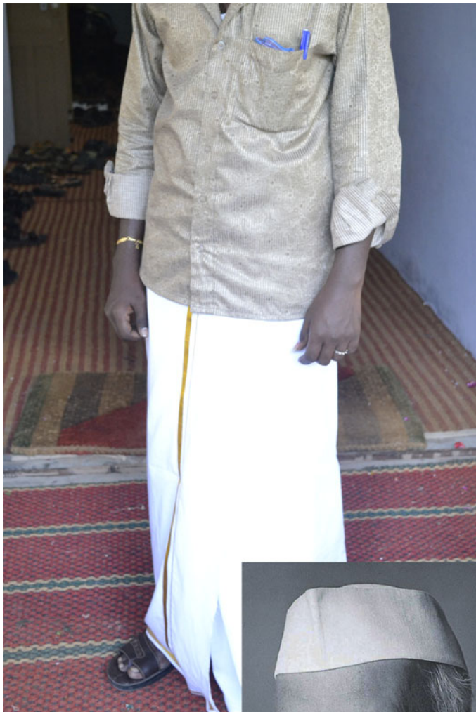
FIGURE 2 Dhoti and Gandhi-cap.

I came in with a lot of optimism. I came in thinking, you know, I'm smart, I'm very close to being brilliant, I can manage this [sarcasm]. And in fact I found it so bloody difficult.... One is that when I came in 1982 everything was in Gujarati....I just couldn't, I couldn't manage it. Fortunately I had a manager; she had been the manager for the old broker. .... Now she could read Gujarati, so she literally ran the show.