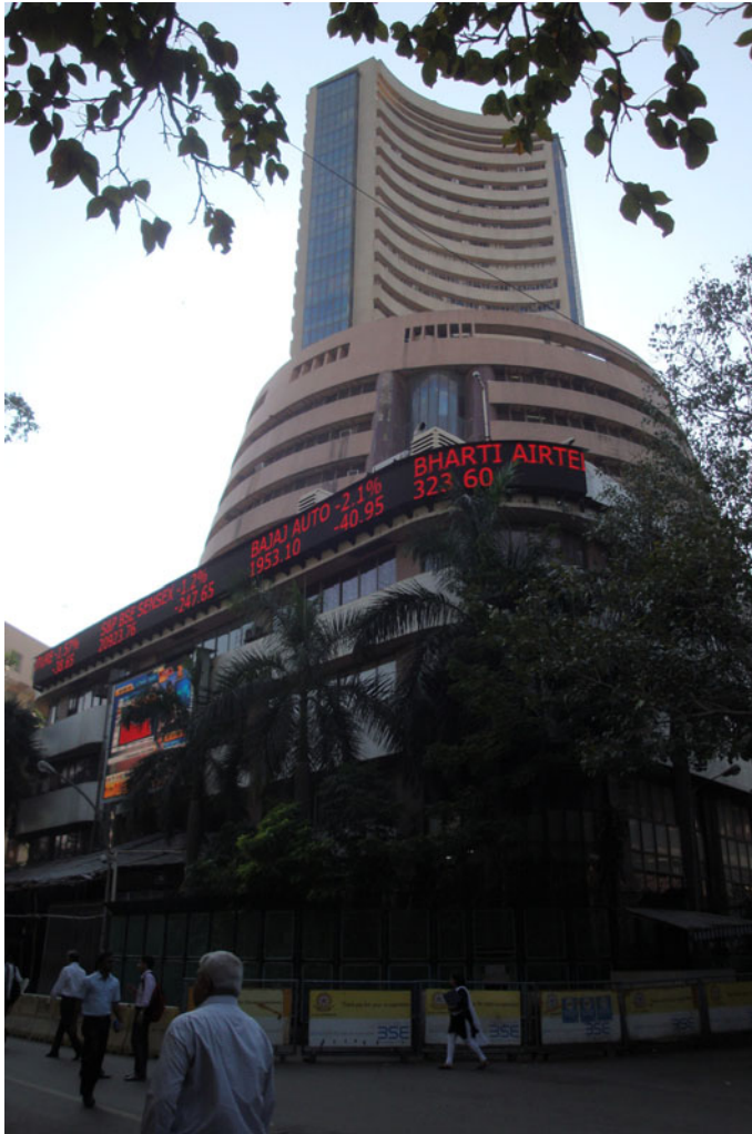
FIGURE 1 The Phiroze Jeejeebhoy Towers.