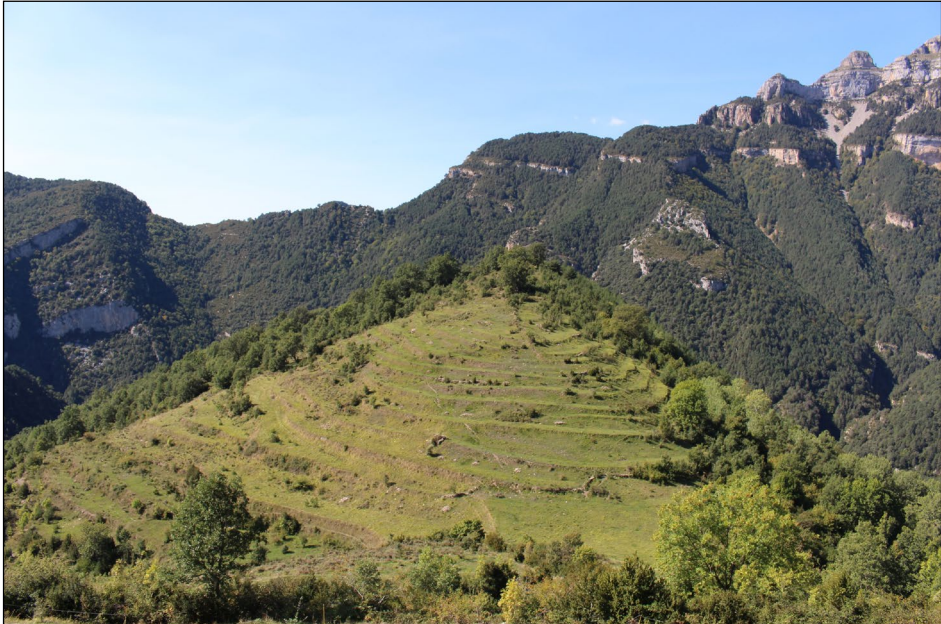
Figure 4. Terraces around Bestué (Pyrenees, Spain). Terraced slopes were built to cultivate steep slopes in mountain areas, creating complex anthropogenic landscapes. Nowadays, most of the terraced systems are abandoned and revegetation processes occur.

landscapes is the creation of agricultural terraces (Tarolli et al. , 2014, 2018). Terracing of hillslopes and mountain sides for agricultural use is certainly one of the largest anthropogenic geomorphic processes in many mountain worldwide areas (Arnáez et al. , 2017; Camera et al. , 2018; Calsamiglia et al. , 2018) (Fig. 4). Tarolli (2016) highlighted other examples as urban development, urban growth, embankments for railways, roads, canals, irrigation networks, open mining or below ground mining, land levelling and soil quarrying. In that sense, the paper written by Raczkowska (2019-in this issue) presents a good example of human impacts in the Tatra Mountains including mining and metallurgy, wood exploitation and oil extraction, as well as tourism activities.