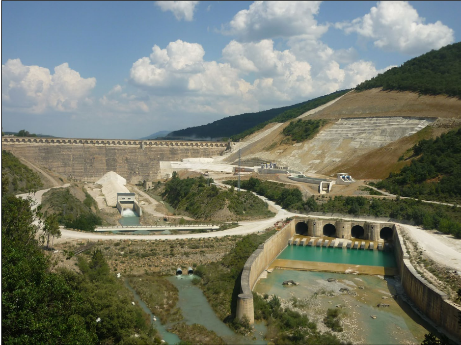
Figure 2. Dam construction in the Central Pyrenees (Yesa reservoir). Dams and reservoirs have been constructed worldwide modifying the hydrological dynamics and transforming the stream network.