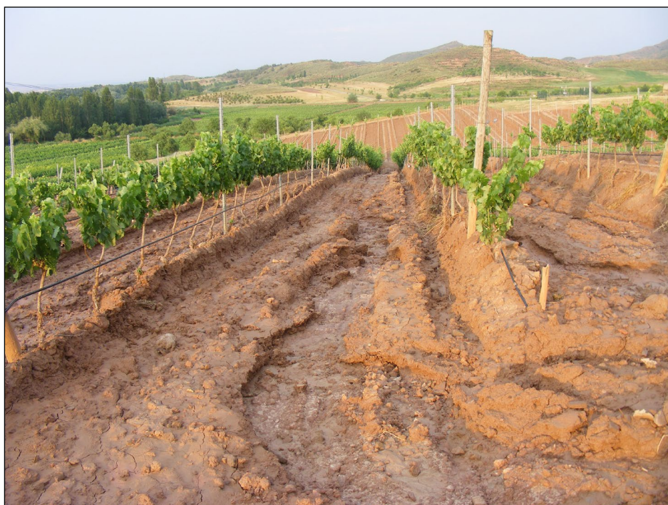
Figure 3. Soil erosion in young vineyard fields in La Rioja (Spain). Agricultural activities modified the soil and intensified soil erosion processes. Many authors suggest that soil erosion in vineyards are the highest soil erosion rates worldwide.

carbon reservoir stored in the fluvial sediments and soils in the catchment. Many studies have also suggested that major land use changes in the Anthropocene has increased soil erosion rates worldwide (i.e. García-Ruiz et al. , 2017) and that agricultural activities show the highest erosion rates (Montgomery, 2007) (see Fig. 3). In that sense, Pijl et al. (2019-in this issue) indicated that vineyard terraces showed the highest erosion rates of all Mediterranean landscape types. Their study demonstrated that vineyard mechanization shows higher erosion rates than non-mechanization fields, concluding that anthropic mechanization and related compaction and transformation of agricultural landscapes (terraces and infrastructures) increase soil loss risk in an already erosion prone landscape type. Finally, Poesen published in 2017 the review paper titled “ Soil erosion in the Anthropocene: Research needs ” concluding that soil erosion in the Anthropocene mainly occurs as a consequence of a combination of natural and human-induced soil erosion processes, although an increasing number of studies indicates that anthropogenic soil erosion processes have become dominant.