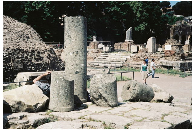
Figure 1: Rome, Forum. Fragments of column shafts that were 12 Roman feet long.

The reader will have difficulty grasping exactly how Vitruvius intended the module to be put to work. The 'method of symmetry' is put into practice by 'taking a