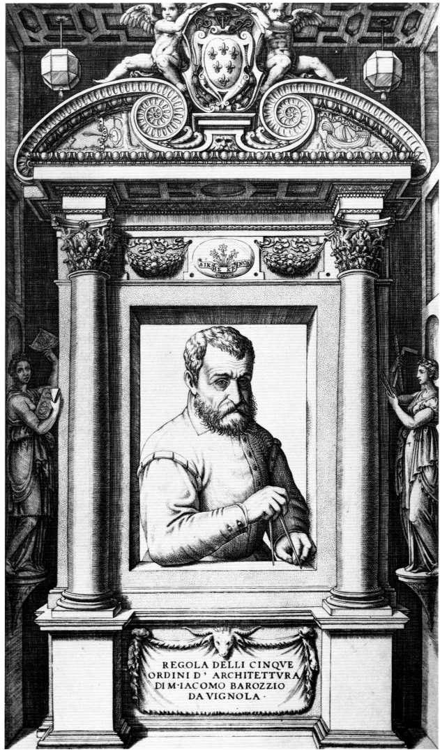
Figure 2: Title page of Vignola, Regola delli cinque ordini , 1562.

Until the second half of the sixteenth century, no real changes can be found in the ways in which authors wrote about the proportions of columns and column shafts. Sebastiano Serlio published the first of his books (Book IV) in 1537, on the five orders, and in it he based his theory on Vitruvius. In describing the proportions of