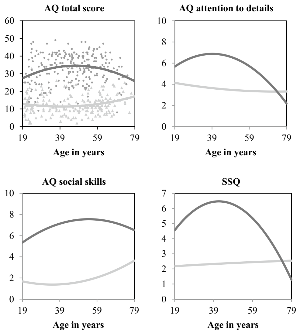
Fig. 1 Age-related differences on the AQ total score, AQ social skills subscale, AQ attention to detail subscale, and SSQ. The darker line and dots indicate the group with autism spectrum disorder