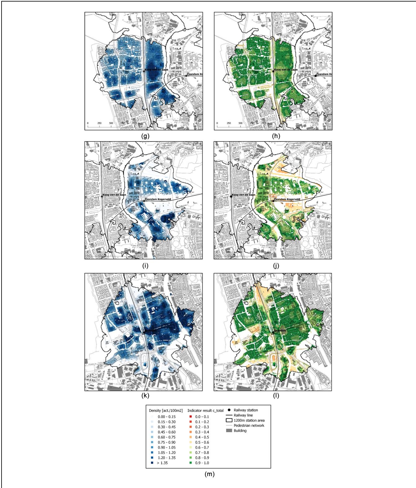
Figure 3. Density distribution \hat{p}(m_k) and co-location indicator result c_{total}(m_k) per grid cell within station areas: (a) Krommenie-Assendelft: density distribution, (b) Krommenie-Assendelft: co-location indicator, (c) Wormerveer: density distribution, (d) Wormerveer: co-location indicator, (e) Zaanse Schans: density distribution, (f) Zaanse Schans: co-location indicator, (g) Koog aan de Zaan: density distribution, (h) Koog aan de Zaan: co-location indicator, (i) Zaandam Kogerveld: density distribution, (j) Zaandam Kogerveld: co-location indicator, (k) Zaandam: density distribution, (l) Zaandam: co-location indicator, and (m) legend.