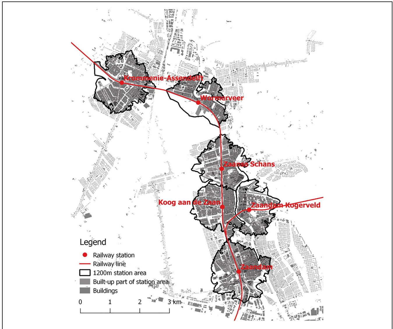
Figure 2 Overview of case study area.