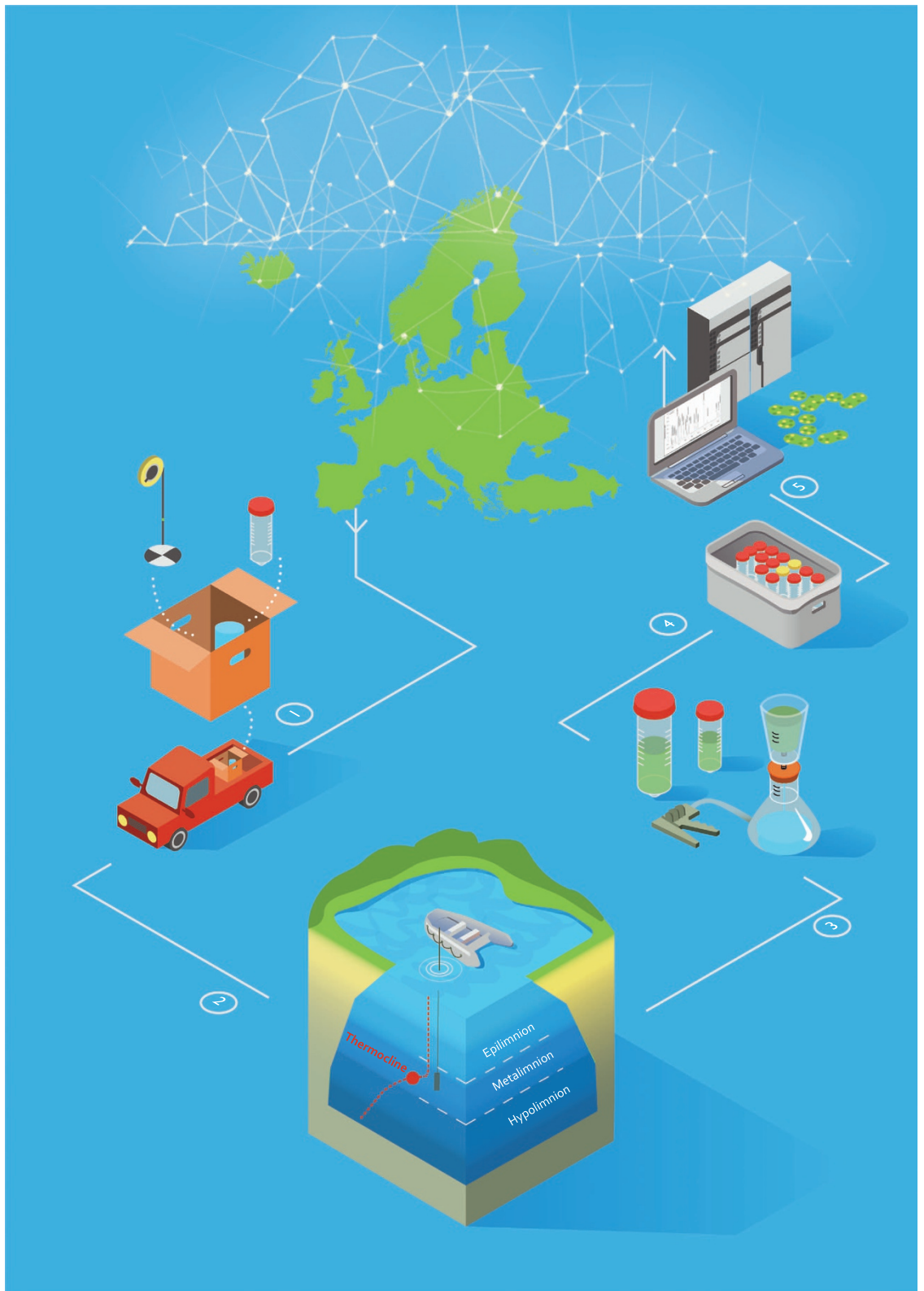
Figure 2. Schematic overview of the European Multi Lake Survey (EMLS). CyanoCOST and NETLAKE members performed the sampling routine by: 1. Preparing the sampling material to meet the standardized procedures 2. Accessing the lake site and acquiring integrated water samples from the bottom of the thermocline up to the water surface 3. Processing and preserving the water samples based on requirements for subsequent analysis 4. Shipping samples to a central receiving laboratory 5. Analysing nutrient, pigment and toxin concentrations in dedicated laboratories. After quality control checks and data integration the dataset returns to the European network and becomes publically available for further research. Created by Sarah O’Leary and Eilish Beirne.