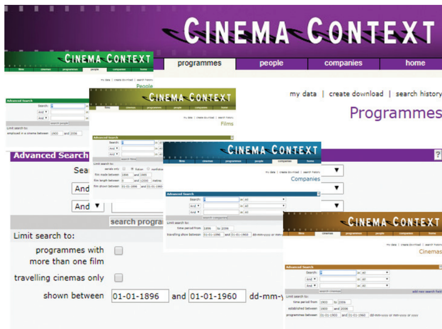
Figure 1. The coloured search tabs on the Cinema Context website each offer a tailor-made faceted search interface for the individual lists of Films, Cinemas, Programmes, People, and Companies.

The choice of films, cinemas, people and companies as the basis for researching Dutch film culture implicitly positions practices of film exhibition and distribution as Cinema Context’s central aspects, rather than film production, form and content. The latter type of information, relating to the films themselves, can be combined with Cinema Context data indirectly via links to IMDb (see above). Cinema Context allows for the study of socio-economic processes and