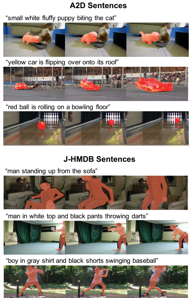
Figure 3: A2D Sentences and J-HMDB Sentences example videos, ground truth segments and sentence annotations.

Results on A2D Sentences. We first evaluate the influence of the number of input frames on our visual encoder and the segmentation result. We run our model with