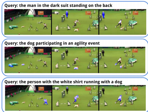
Figure 1: From a natural language input sentence our proposed model generates a pixel-level segmentation of an actor and its action in video content.

We are inspired by recent progress in vision and language solutions for challenges like object retrieval [6, 7, 17], person search [14, 30, 34], and object tracking [15]. To arrive at object segmentation from a sentence, Hu et al. [6] rely on an LSTM network to encode an input sentence into a vector representation, before a fully convolutional network