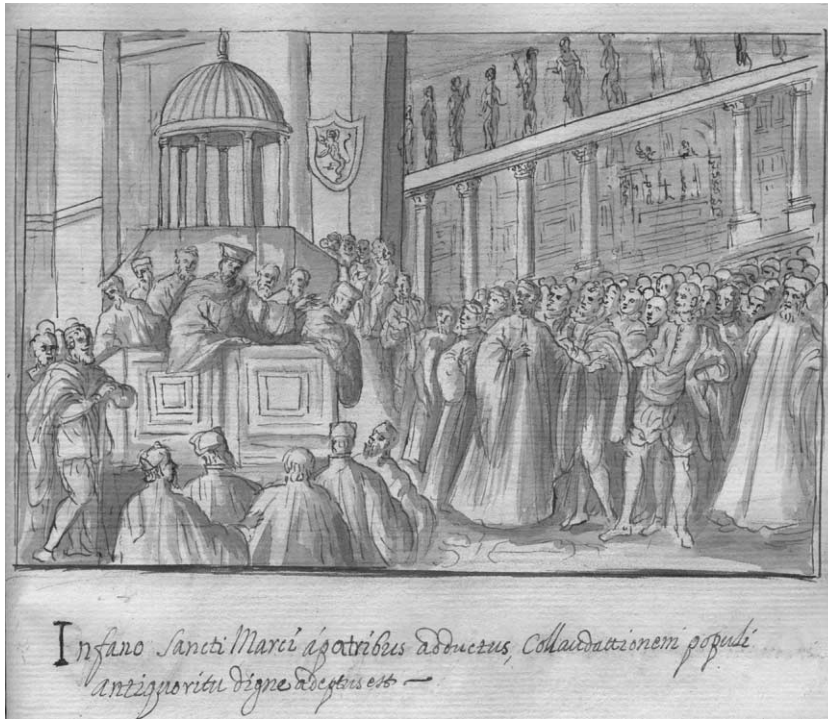
FIG. 2.—Illustration from the Morosini-Grimani family chronicle showing Marino Grimani's acceptance speech to the crowds in the Basilica. Biblioteca del Museo Correr, Codice Morosini-Grimani, Origine della famiglia Grimana , 270, c.64. Color version available as an online enhancement.

bution of one hundred coins of silver, but Grimani clearly took this as indicating a minimum. One of the first things he did after the conclave was to pay the Zecca (Mint) 1,600 ducats to cast celebratory coins: the next day he and his male relatives tossed some 1,400 ducats worth of these coins to the assembled crowds as they were carried around the piazza, an act recorded in an illustration in a family chronicle (fig. 3). His wife and daughters threw the rest from the Ducal Palace's windows. This itself was a great expense, considering that a skilled craftsman in the Arsenal made some fifty ducats a year, but it was only one-fifth of the festivities' total cost. 172 Grimani paid a staggering 7,000 ducats for the celebrations, spending it on dinners, salaries for musicians, cooks, porters, guards, decorations for his own palazzo , and, predictably, acts of munificence: he had his