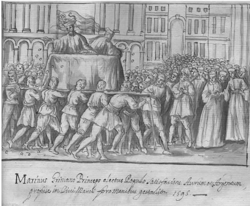
FIG. 3.—Marino Grimani distributing money to the crowds during the sparsio . Biblioteca del Museo Correr, Codice Morosini-Grimani, Origine della famiglia Grimana , 270, c.63. Color version available as an online enhancement.

brother dispense eighty ducats to the inhabitants of their own parish of San Luca and ordered that almost five hundred ducats be distributed to poor Venetians and various institutions. 173