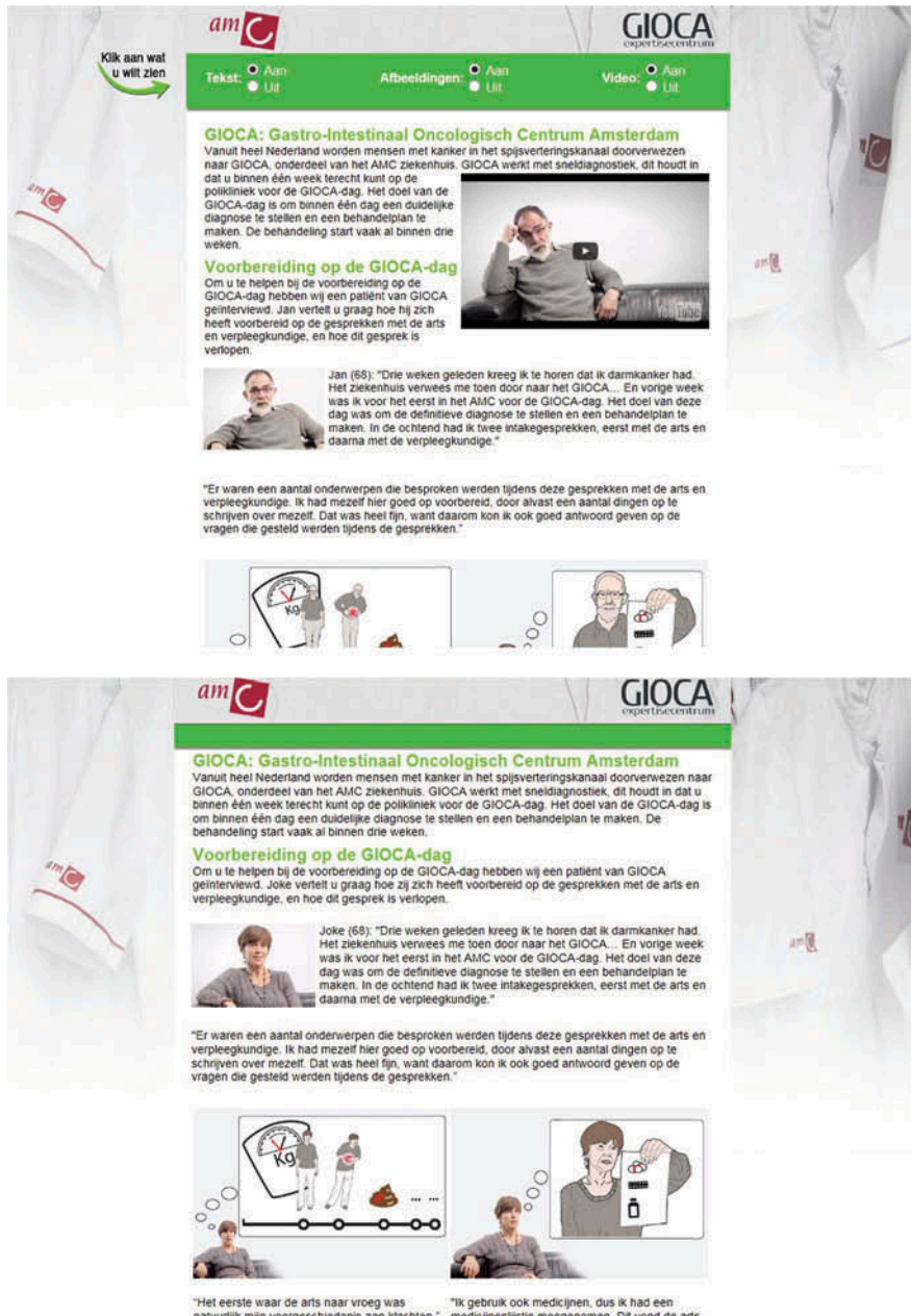
Fig. 1. Top: Mode-tailored website with male character (text, illustration, and video mode selected). Bottom: Non-tailored website with text and illustrations with female character.

participants had to select at least one mode before they saw any additional information.