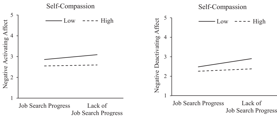
Fig. 1. Depiction of the relation between job search difficulties and positive activating and positive deactivating affect (Study 1), and the relation between lack of job search progress and negative activating and deactivating affect (Study 2), as moderated by self-compassion (1SD below and above the mean).

negative connotation. Asking job seekers about difficulties during job search may particularly tap into negative affective responses for both high and low self-compassioned individuals. In the second study we therefore opted for a broader conceptualization of negative job search experiences by assessing perceived lack of progress (cf. Wanberg et al., 2010).