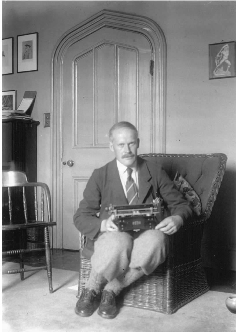
FIG. 3. Sir Harold Jeffreys (1891–1989) in 1928.

gives any ground for inferring a difference between the corresponding ratios in the complete populations. Let us suppose that in the first population the fraction of the whole possessing the property is [\theta_0] , in the second [\theta_1] . Then we are really being asked whether [\theta_0 = \theta_1] ; and further, if [\theta_0 = \theta_1] , what is the posterior probability distribution among values of [\theta_0] ; but, if [\theta_0 \neq \theta_1] , what is the distribution among values of [\theta_0] and [\theta_1] . (p. 203)