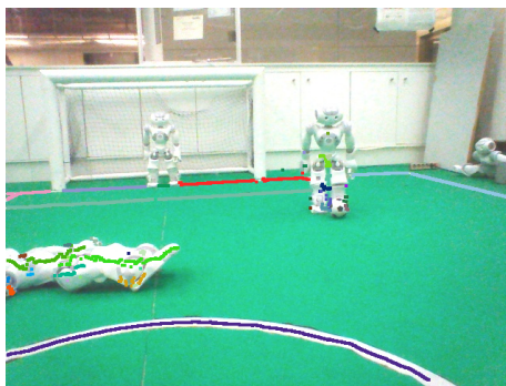
Figure 2: Cluster assignment algorithm