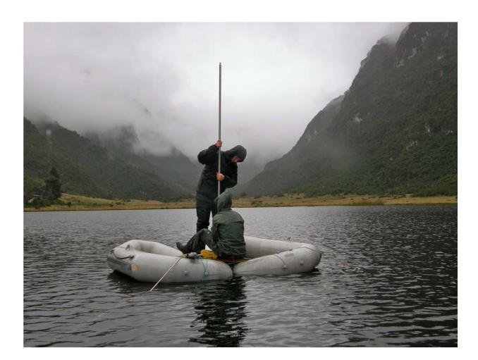
Figure 2. (color online) A core being raised using a Colinvaux-Vohnout piston sampler from a raft of inflatable boats at Lake Llaviucu (also called Surucucho) in June 2010. This lake had previously been cored by Colinvaux's team in 1988 (Colinvaux et al., 1997).