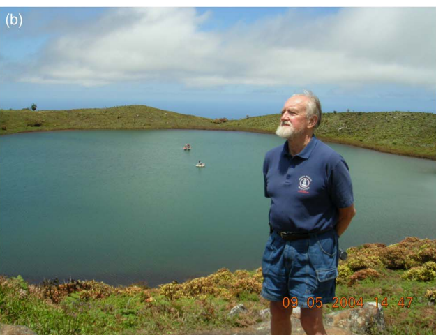
Figure 1. (color online) (a) Dan Livingstone. (b) Paul Colinvaux at El Junco Crater Lake, Galapagos Islands.

framework of knowledge that both Dan and Paul helped establish. In their search for the ice age tropics, both Dan and Paul came to realize the rarity of ancient lakes in the tropical lowlands and the potential importance of any such archive. Consequently, they were at the forefront of multiproxy analysis, actively seeking collaborators to maximize data extraction from sediments using X-radiography, geochemistry, diatoms, charcoal, wood, phytoliths, and cuticles (e.g., Livingstone and Fleischer, 1963; Steinitz-Kannan et al., 1986; Maley et al., 1990; Bush et al., 1992).