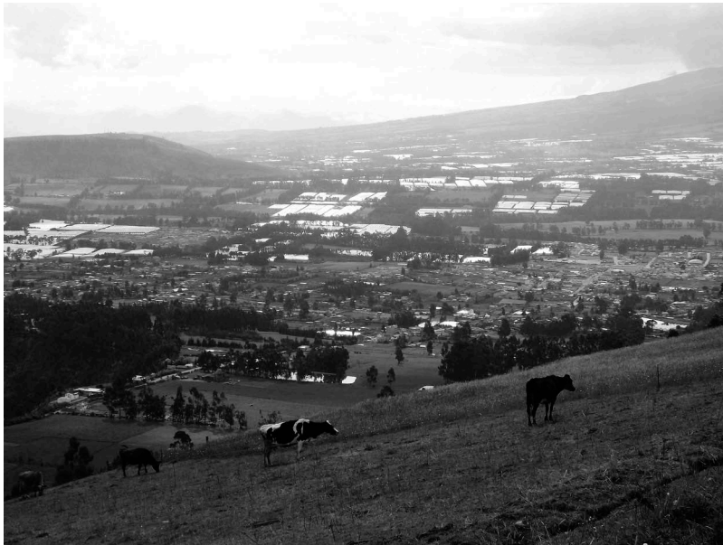
Figure 1. Part of the Pisque River watershed, showing the white plastic of large and small rose greenhouses.

The unequal water allocation and bad service towards the small landowners by the municipality led to a massive protest in 2006, after which indigenous communities took control of the system. In 2008 the water users’ organization received the official