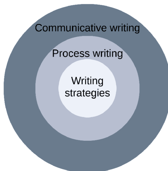
Figure 1. Three embedded approaches to the teaching of writing in the comprehensive writing program.

In the comprehensive writing program we focused on communicative aspects of writing, on writing as a process, and on the teaching of genre-specific writing strategies for five functions or genres; description, instruction, explanation, argumentation, and narration. Figure 1 visualizes how the three approaches were linked in the comprehensive writing program.