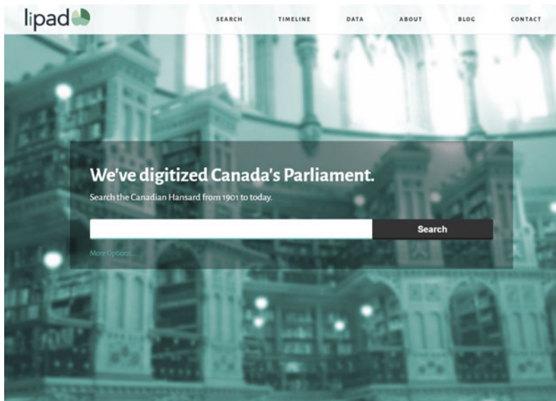
FIGURE 3 Lipad.ca Home Page