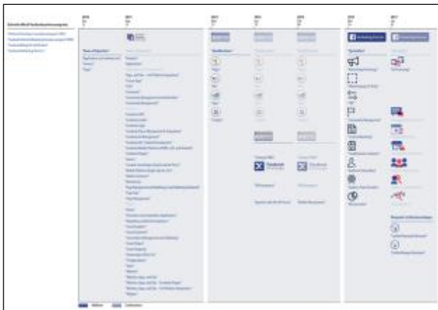
Figure 2. Timeline diagram of Facebook’s changing partner specialties, types of certification, and associated partner badges since 2010. ( bit.ly/2rKK5M8 )

In order to gain insight into changing platform–partner relations, changing business goals, and changing platform practices, we have examined consecutive changes made to Facebook’s marketing partner programs across these three periods (Figure 2). We can observe a gradual change from only three “Areas of Expertise” in 2010 to an extensive list of self-defined specialties in 2011 under a single “Preferred Developer Consultant” badge, to a small set of curated “Preferred Marketing Developer” badges displaying one or more of the four main “Qualifications” in 2012, to a single “Marketing Partner” badge representing multiple “Specialties” since 2015. These changes are accompanied by changing terminologies, shifting from expertise and qualification in Facebook products (e.g., “Pages”, “Apps”) towards employing more widely familiar professional marketing terms (e.g., “Ad Technology”, “Media Buying”, “Content Marketing”). Badges like these, along with other forms of certification, have existed for much longer (e.g., with SAP, Oracle, IBM, and Google’s partner programs), and reflect broader developments in the online advertising and digital marketing industries. We can thus observe an increasing professionalization of digital marketing practices with, or built on top of Facebook’s platform.